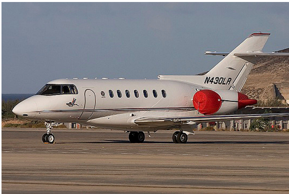
Hawker 1000 Engine Cover Set

The Hawker Beechcraft 1000 Intake Covers are designed to install easily yet be completely storable. A spring steel hoop is sewn into the hem of each cover, allowing them to be installed without climbing onto the wing or using a stepladder. To store the covers the spring steel hoop folds like a band-saw blade into three nesting rings. Each cover folds into a compact circular bundle which is stored in the included duffle bag, yet they unfold quickly for use. The Tri-Fold Ring cover is made of medium weight nylon which is available in a variety of colors to match the paint trim. Each cover set comes complete with installation and folding instructions. The aircraft's registration number can be silkscreened onto the cover for an extra charge.