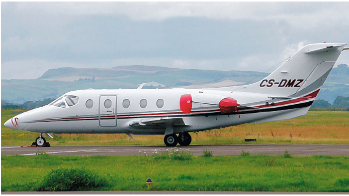
Beechjet 400 Engine & Pitot Covers