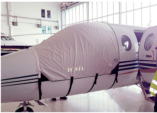
Beechjet 400A Cockpit Cover