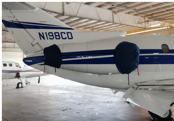
Hawker 750 Engine Covers

Cockpit Heatshields are interior sunshades for the aircraft's cockpit. The product is a unique composite of closed-cell foam with a silver mylar finish. The semi-rigid design is stiff enough to stand inside the window framing. The set folds up flat and is easily stored in the included storage sleeve. Some designs may require velcro and suction cups. Our Heatshields for jets are offered white side out because some aircraft manufacturers have issued advisories against reflective window inserts due to potential heat damage. A Heatshield is an excellent short-term remedy for cockpit overheating, but an external fabric cover is more effective for long-term protection.