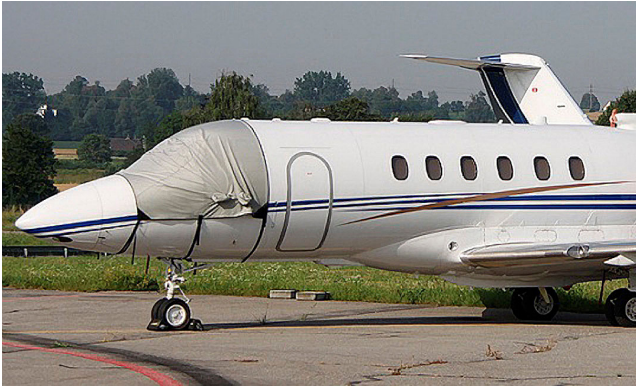
Hawker 800 Cockpit Cover

This cover type is made from Silver Acrylic Sunbrella canvas and is 100% lined with a soft and smooth microfiber. Bruce's Custom Covers developed this material combination especially for aircraft protection. The outer material is medium weight and treated for water resistance, UV resistance and anti-static buildup. The inner lining is a very soft and smooth microfiber to prevent scratching. The material is very reflective, and tests show that the cabin interior temperature can be reduced to near-ambient temperature on the hottest of days. It is water, ice and snow repellent, yet breathable to allow moisture to escape from between the cover and the aircraft surface.