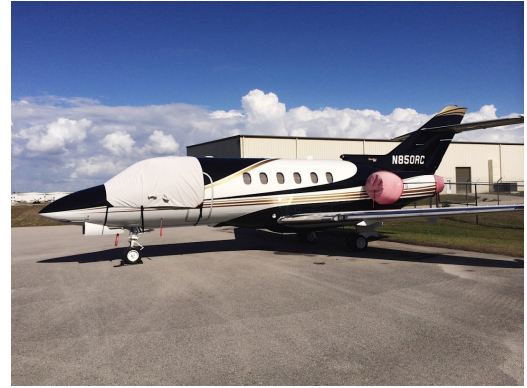
Hawker 800 Cockpit Cover, extended aft 24"