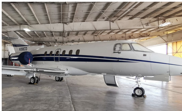
Hawker 750 HeatShields & Engine Covers