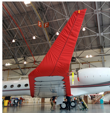
Gulfstream G550 Wing/Winglet Covers