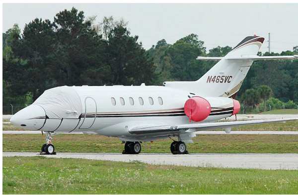
Hawker 800 Cockpit Cover and Engine Covers set