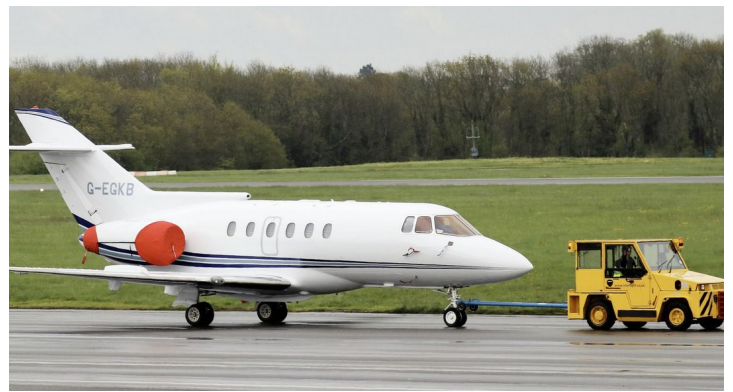
Hawker 800 Tri-Fold Engine Covers.