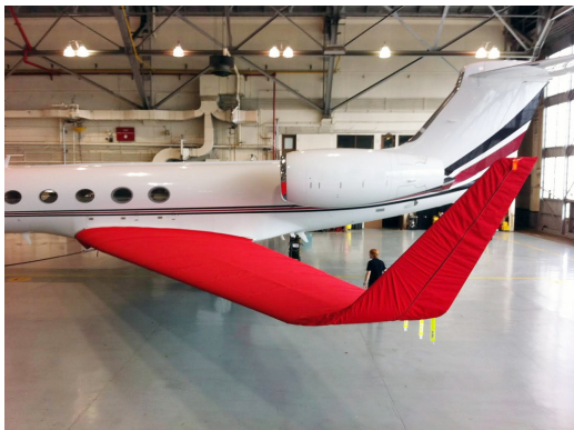
Gulfstream G550 Wing/Winglet Covers

WINTER USE MATERIAL - Made with Solution-Dyed Polyester fabric, this option is intended for seasonal use to aid in deicing, rain mitigation, or for occasional travel. The material is lighter and more compact, but more susceptible to UV damage and may have a shorter useful life if used continuously outside than the all-year use material.