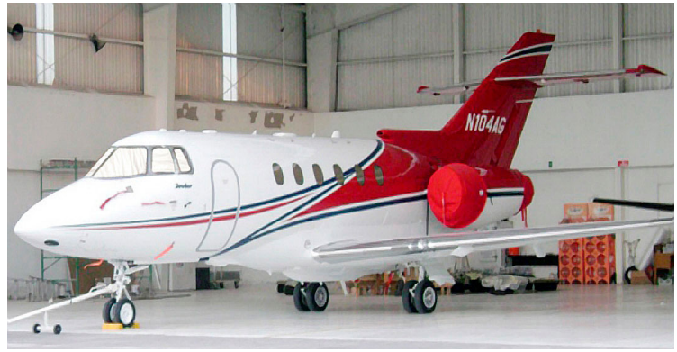
Hawker 900XP Engine Covers, Cockpit HeatShields, and Pitots/AOA Cover set