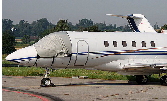
Hawker 800 Cockpit Cover

This cover type is made from Silver Acrylic Sunbrella canvas and is 100% lined with a soft and smooth microfiber. Bruce's Custom Covers developed this material combination especially for aircraft protection. The outer material is medium weight and treated for water resistance, UV resistance and anti-static buildup. The inner lining is a very soft and smooth microfiber to prevent scratching. The material is very reflective, and tests show that the cabin interior temperature can be reduced to near-ambient temperature on the hottest of days. It is water, ice and snow repellent, yet breathable to allow moisture to escape from between the cover and the aircraft surface.