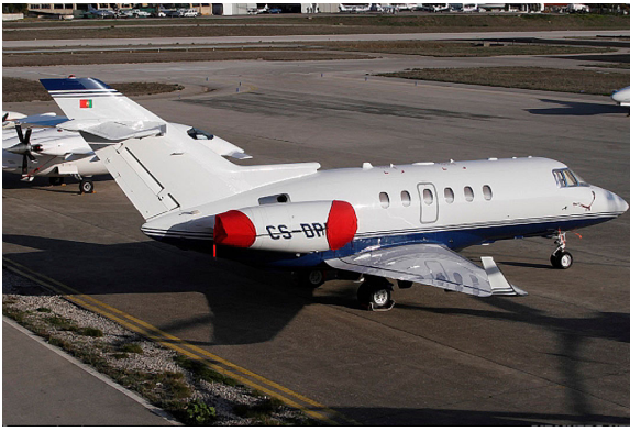
Hawker 900XP Engine Inlet/Exhaust Cover Set & Pitot AOA Cover Set & Cockpit HeatShield Set