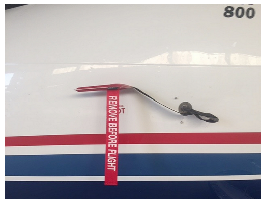
Hawker Beechcraft 800, 800XP, 850XP Pitot Covers With Aoa Straps

The Engine Inlet Plugs are custom fit for your Hawker Beechcraft 900XP intakes, made with heavy-duty vinyl material, and stuffed with a single block of sculpted urethane foam. Each plug has a zipper that allows the foam to be removed and dried if necessary. Engine plugs have 'remove before flight' streamers sewn onto the face of the plugs. Most plugs are imprinted with the aircraft registration number in black for an extra charge. Storage bag NOT included. Engine plugs may be inserted after flight when the engine is still warm. Engine Inlet Plugs are commonly referred to as Cowl Plugs, Intake Plugs, Cowl Blocks, Engine Blocks, and Engine Bungs.