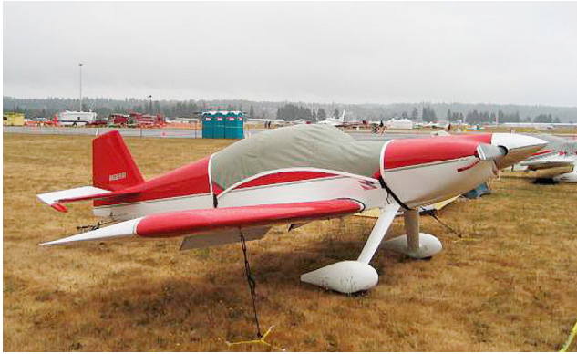
Harmon Rocket Canopy Cover & Engine Inlet Plugs