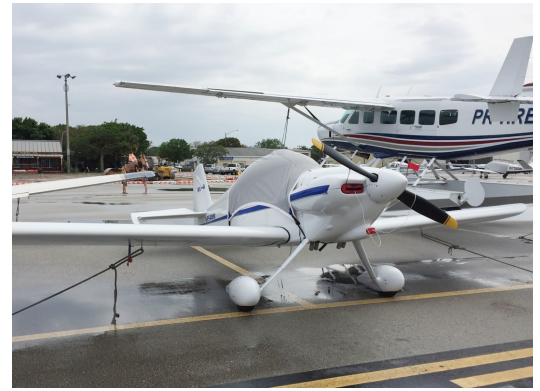
Van's RV-4/Harmon Rocket Travel Cover