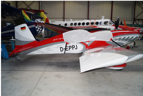
Harmon Rocket III Canopy Cover