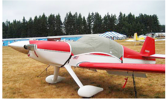
Harmon Rocket Canopy Cover & Engine Inlet Plugs