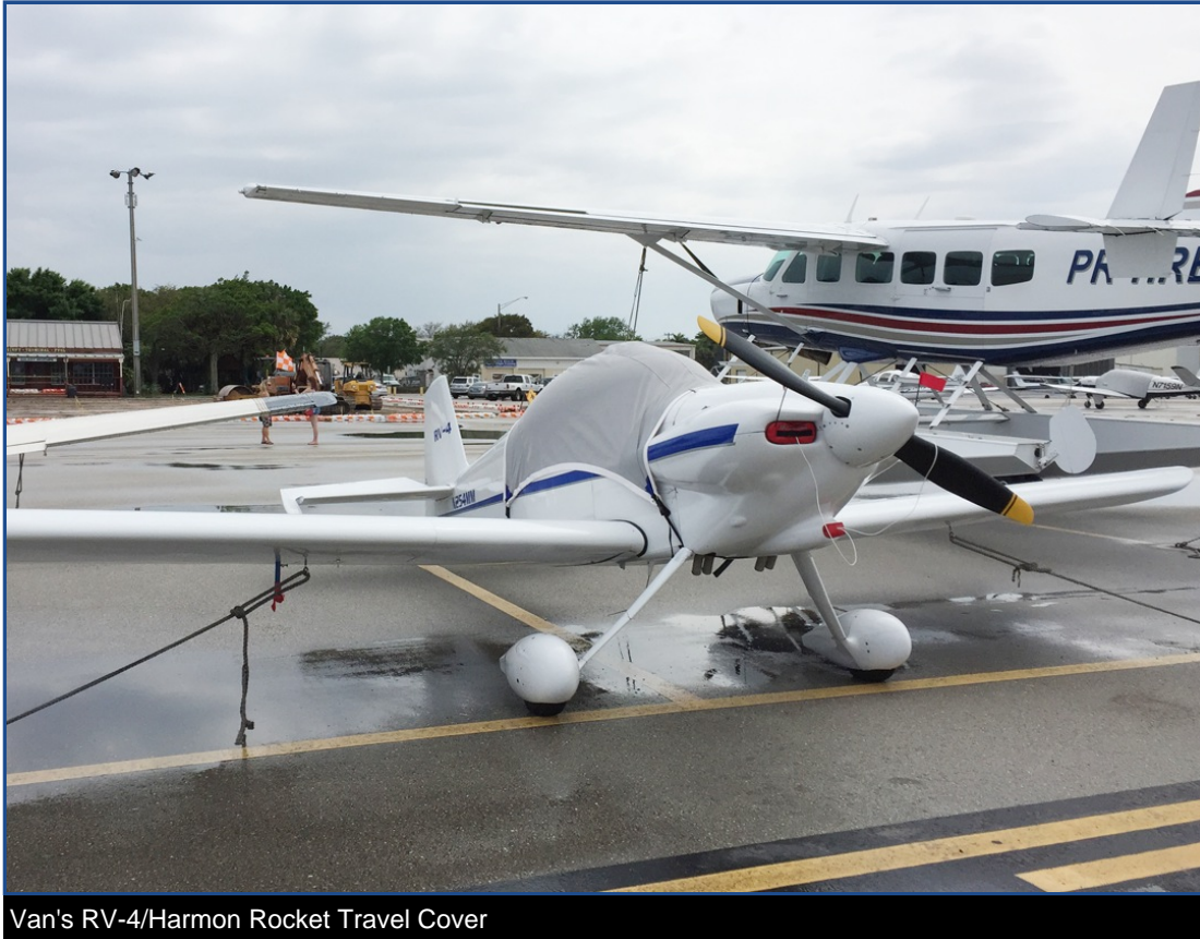
Van's RV-4/Harmon Rocket Travel Cover