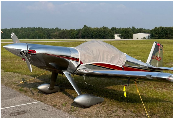
Harmon Rocket Travel Light Weight Canopy Cover Std Windshield

Engine Inlet Plugs are custom fit for your Harmon Rocket intakes, made with heavy-duty vinyl material, and stuffed with a single block of sculpted urethane foam. Each plug has a zipper that allows the foam to be removed and dried if necessary. Engine plugs have warning flags that are visible from the cockpit or 'remove before flight' streamers sewn onto the face of the plugs. Most plugs are imprinted with the aircraft registration number in black for an extra charge. Storage bag NOT included. Engine plugs may be inserted after flight when the engine is still warm. Engine Inlet Plugs are commonly referred to as Cowl Plugs, Intake Plugs, Cowl Blocks, Engine Blocks, and Engine Bunges.