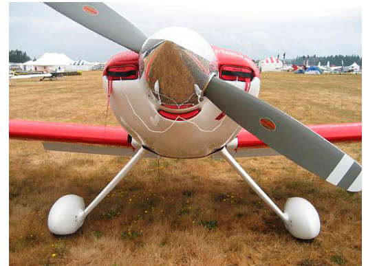
Harmon Rocket Engine Inlet Plugs