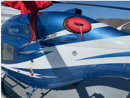
Bell 429 Exhaust Plug

The Engine Exhaust Plugs are custom fit for your Eagle R&D Helicycle exhaust openings, made with heavy-duty vinyl material, and stuffed with a single block of sculpted urethane foam. Exhaust plugs have 'Remove Before Flight' streamers sewn onto the face of the plugs. Exhaust plugs may be inserted soon after flight when the engine is still warm. Engine Inlet Plugs are commonly referred to as Cowl Plugs, Intake Plugs, Cowl Blocks, Engine Blocks, and Engine Bungs.