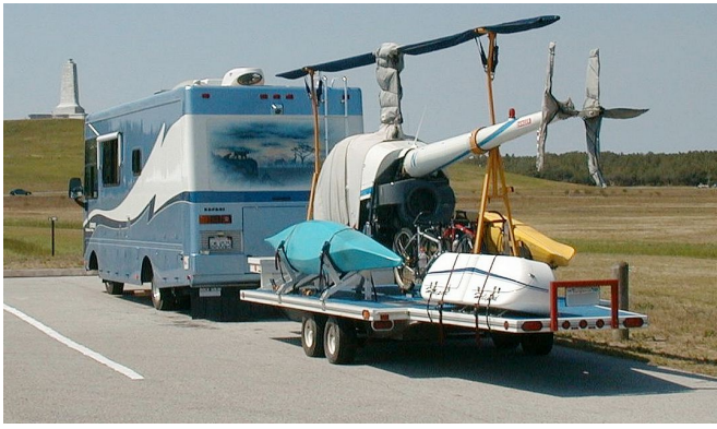
Robinson R-22 Bubble, Rotor Mast, Blades, Tail Rotor & Stabilizer Covers