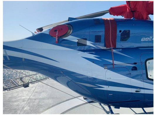
Bell 429 Exhaust Plug, Rotor Mast Cover