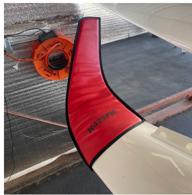
Stemme S-10 & S-12 Wingtip Pads