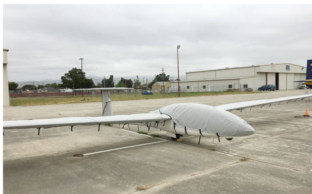
DG-505 Canopy/Nose, Wing, Empennage & Horiz. Stab. Covers

WINTER USE MATERIAL - Made with Solution-Dyed Polyester fabric, this option is intended for seasonal use to aid in deicing, rain mitigation, or for occasional travel. The material is lighter and more compact, but more susceptible to UV damage and may have a shorter useful life if used continuously outside than the all-year use material.