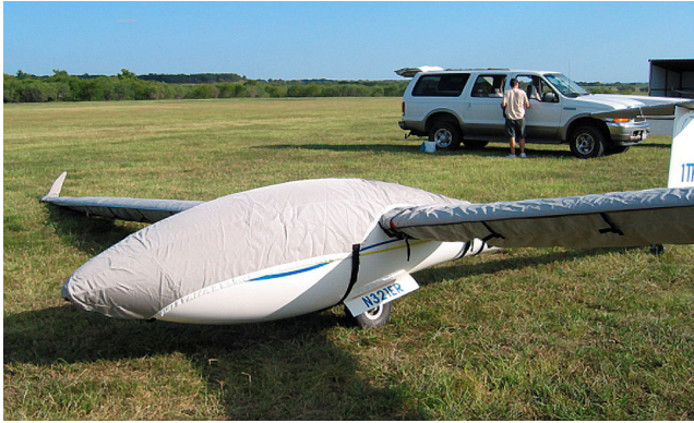
Canopy/Nose Cover, Wings and Horizontal Stab Covers

This cover type is made from Silver Acrylic Sunbrella canvas and is 100% lined with a soft and smooth microfiber. Bruce's Custom Covers developed this material combination especially for aircraft protection. The outer material is medium weight and treated for water resistance, UV resistance and anti-static buildup. The inner lining is a very soft and smooth microfiber to prevent scratching. The material is very reflective, and tests show that the cabin interior temperature can be reduced to near-ambient temperature on the hottest of days. It is water, ice and snow repellent, yet breathable to allow moisture to escape from between the cover and the aircraft surface.