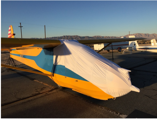
Schweizer SGU 2-22EK Canopy/Nose Cover, test fit cover