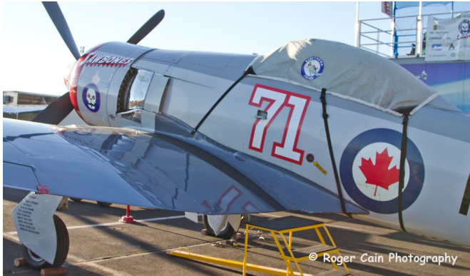
Hawker Sea Fury Canopy Cover

This cover type is made from Silver Acrylic Sunbrella canvas and is 100% lined with a soft and smooth microfiber. Bruce's Custom Covers developed this material combination especially for aircraft protection. The outer material is medium weight and treated for water resistance, UV resistance and anti-static buildup. The inner lining is a very soft and smooth microfiber to prevent scratching. The material is very reflective, and tests show that the cabin interior temperature can be reduced to near-ambient temperature on the hottest of days. It is water, ice and snow repellent, yet breathable to allow moisture to escape from between the cover and the aircraft surface.