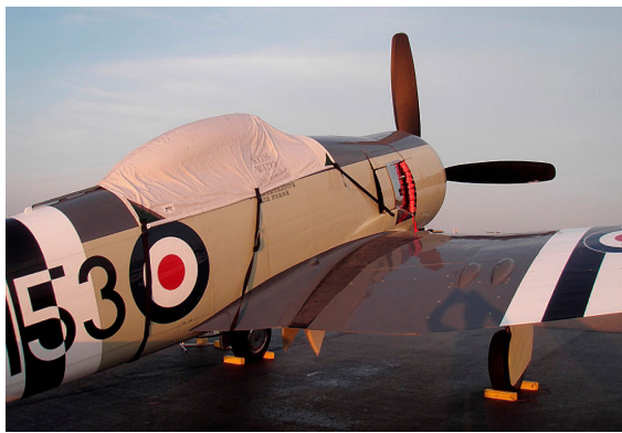
Sea Fury Canopy Cover & Exhaust Plugs