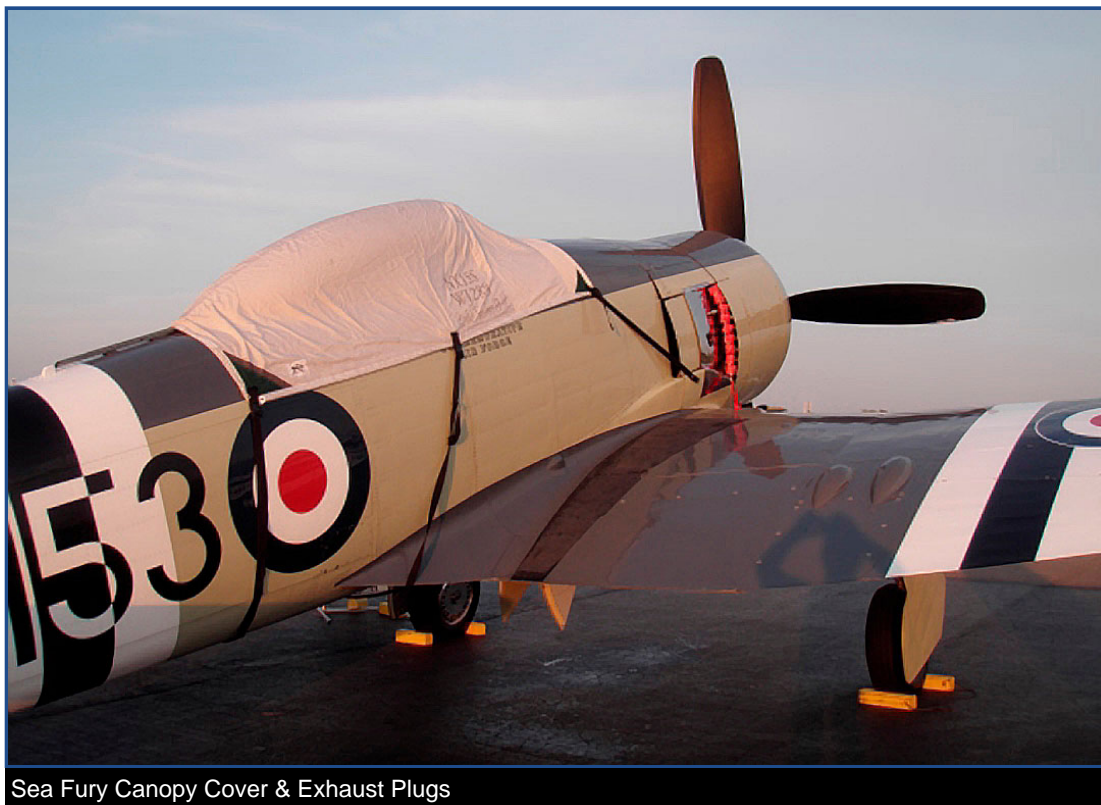
Sea Fury Canopy Cover &amp; Exhaust Plugs