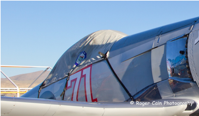
Hawker Sea Fury Canopy Cover