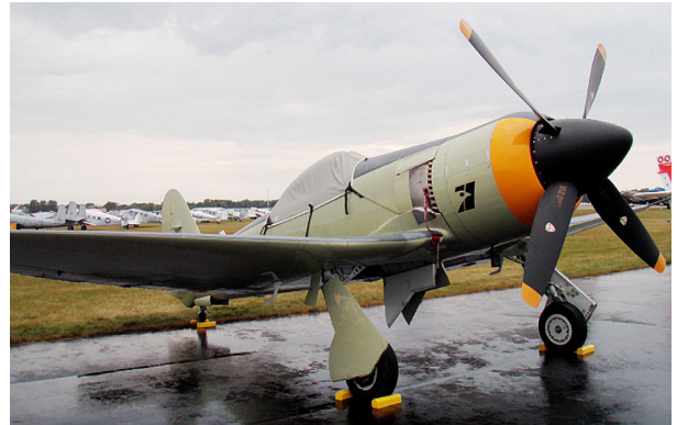
Sea Fury Canopy Cover & Exhaust Plugs