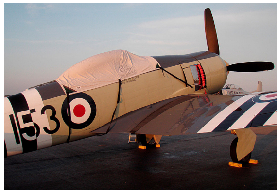
Sea Fury Canopy Cover & Exhaust Plugs