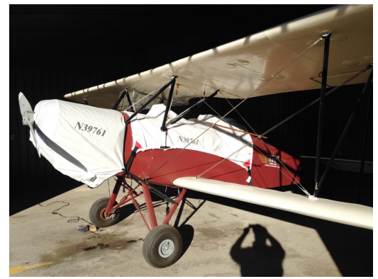
Hatz Biplane Canopy and Engine Covers