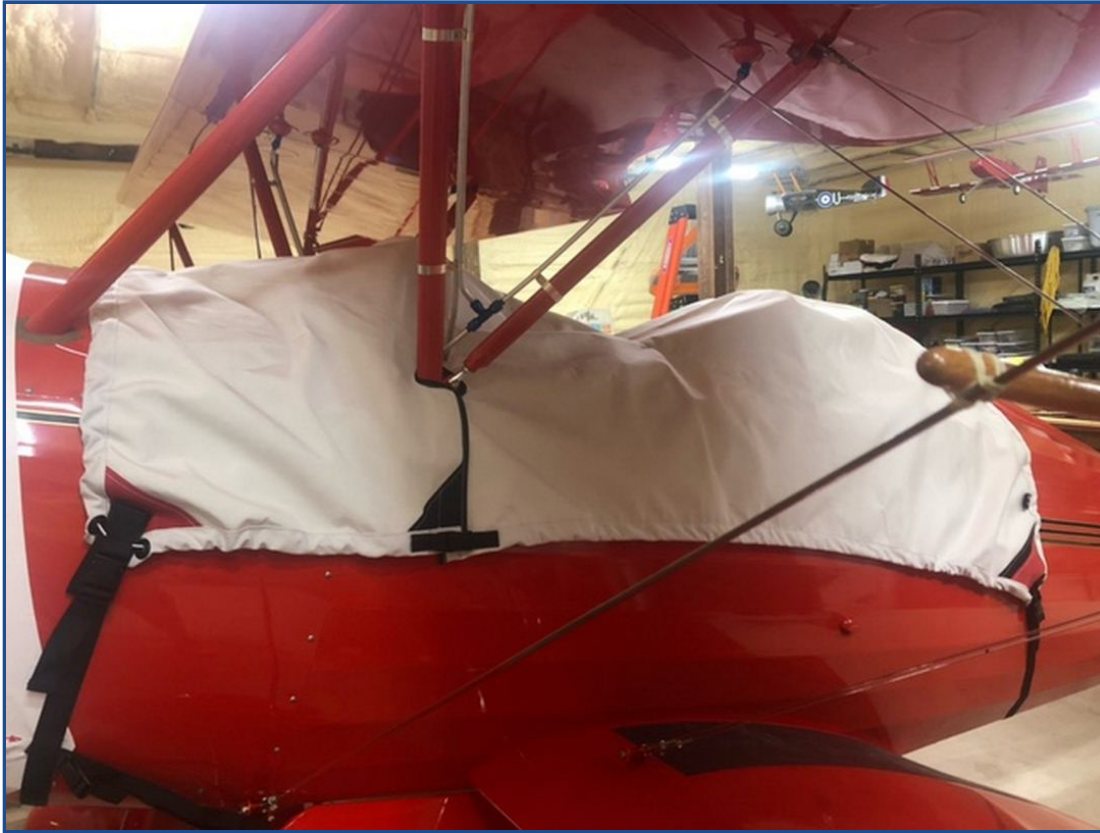
Hatz Biplane CB-1 Canopy Cover