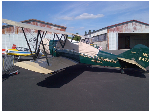
Travelair 4000 Canopy and Engine Cover