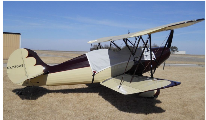
Hatz Biplane Canopy Cover