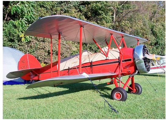
Waco ASO Canopy Cover