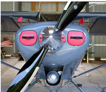
Piper PA-18 Super Cub Engine Inlet Plugs

Engine Inlet Plugs are custom fit for your Hatz Biplane CB-1 intakes, made with heavy-duty vinyl material, and stuffed with a single block of sculpted urethane foam. Each plug has a zipper that allows the foam to be removed and dried if necessary. Engine plugs have warning flags that are visible from the cockpit or 'remove before flight' streamers sewn onto the face of the plugs. Most plugs are imprinted with the aircraft registration number in black for an extra charge. Storage bag NOT included. Engine plugs may be inserted after flight when the engine is still warm. Engine Inlet Plugs are commonly referred to as Cowl Plugs, Intake Plugs, Cowl Blocks, Engine Blocks, and Engine Bungs.