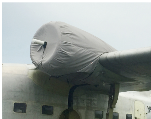
Grumman Albatross Engine Covers

This cover type is made from Silver Acrylic Sunbrella canvas and is 100% lined with a soft and smooth microfiber. Bruce's Custom Covers developed this material combination especially for aircraft protection. The outer material is medium weight and treated for water resistance, UV resistance and anti-static buildup. The inner lining is a very soft and smooth microfiber to prevent scratching. The material is very reflective, and tests show that the cabin interior temperature can be reduced to near-ambient temperature on the hottest of days. It is water, ice and snow repellent, yet breathable to allow moisture to escape from between the cover and the aircraft surface.