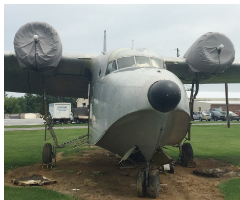
Grumman Albatross Engine Covers