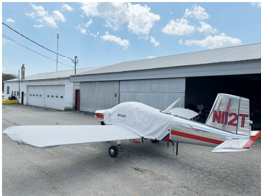
Thorp Sky Scooter Extended Canopy Cover & Wing Covers

This cover type is made from Silver Acrylic Sunbrella canvas and is 100% lined with a soft and smooth microfiber. Bruce's Custom Covers developed this material combination especially for aircraft protection. The outer material is medium weight and treated for water resistance, UV resistance and anti-static buildup. The inner lining is a very soft and smooth microfiber to prevent scratching. The material is very reflective, and tests show that the cabin interior temperature can be reduced to near-ambient temperature on the hottest of days. It is water, ice and snow repellent, yet breathable to allow moisture to escape from between the cover and the aircraft surface.