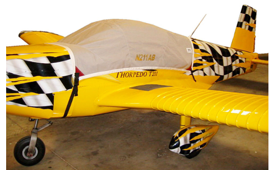
Indus Thorpedo Canopy Cover