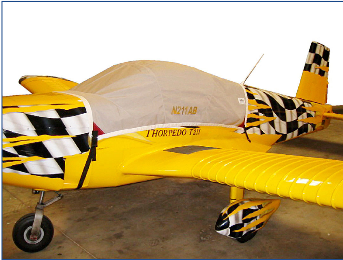
Indus Thorpedo Canopy Cover