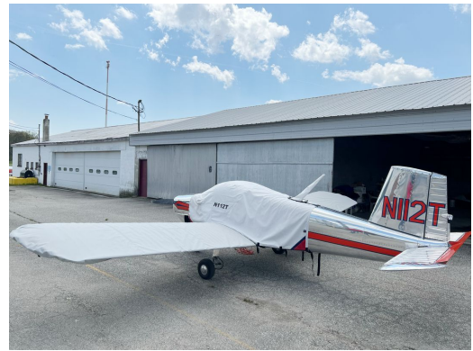
Thorp Sky Scooter Extended Canopy Cover & Wing Covers