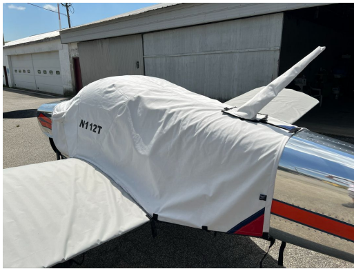
Thorp Sky Scooter Extended Canopy Cover & Wing Covers

WINTER USE MATERIAL - Made with Solution-Dyed Polyester fabric, this option is intended for seasonal use to aid in deicing, rain mitigation, or for occasional travel. The material is lighter and more compact, but more susceptible to UV damage and may have a shorter useful life if used continuously outside than the all-year use material.