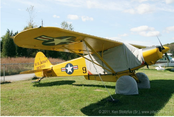
Piper L-21b Extended Canopy Cover, Tire Covers

The Interstate, Arctic Tern All Models (and similar) Tailcone Cover fits onto the tailcone area to cover the holes that birds can fly into and nest. The cover easily straps onto the leading edge of the horizontal stabilizer with padded hooks or overlaps with the elevators slightly and attaches under the horizontal stabilizers with adjustable straps. Tailcone Covers are normally made with Solution-Dyed Polyester or Acrylic Sunbrella .