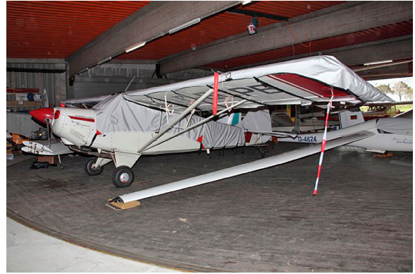
Cessna 195 Canopy Cover, extended forward and over gas caps Aviat Husky Engine Plugs, Canopy, Wing & Empennage Covers