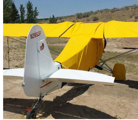
Piper PA-18 Super Cub Extended Canopy Cover, Wing &amp; Tire Covers