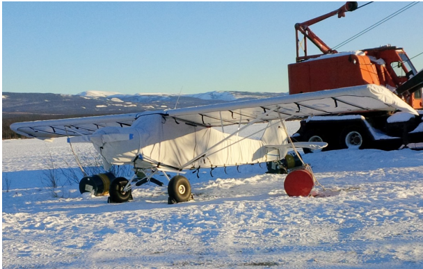
Piper Super Cub Complete Cover Set