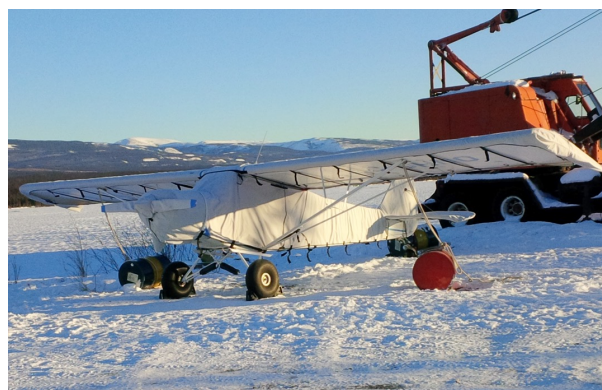
Piper Super Cub Complete Cover Set