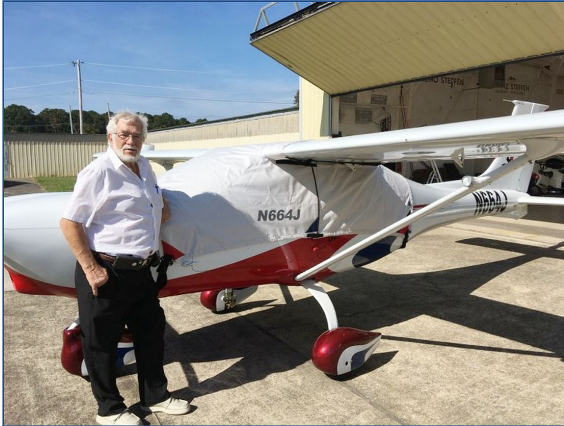
Jabiru 230SP Canopy Cover, Over-Top Style