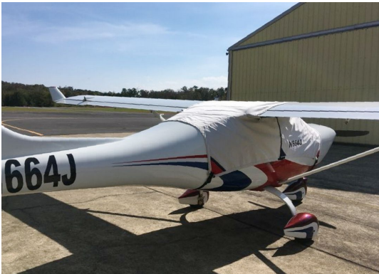
Jabiru J230-SP Canopy Cover, Over-Top Style