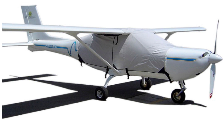
Jabiru Extended Canopy Cover

This cover type is made from Silver Acrylic Sunbrella canvas and is 100% lined with a soft and smooth microfiber. Bruce's Custom Covers developed this material combination especially for aircraft protection. The outer material is medium weight and treated for water resistance, UV resistance and anti-static buildup. The inner lining is a very soft and smooth microfiber to prevent scratching. The material is very reflective, and tests show that the cabin interior temperature can be reduced to near-ambient temperature on the hottest of days. It is water, ice and snow repellent, yet breathable to allow moisture to escape from between the cover and the aircraft surface.