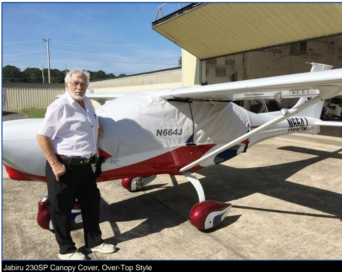
Jabiru 230SP Canopy Cover, Over-Top Style