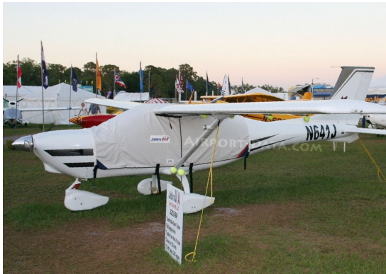
Jabiru J230 Canopy Cover

This cover type is made from Silver Acrylic Sunbrella canvas and is 100% lined with a soft and smooth microfiber. Bruce's Custom Covers developed this material combination especially for aircraft protection. The outer material is medium weight and treated for water resistance, UV resistance and anti-static buildup. The inner lining is a very soft and smooth microfiber to prevent scratching. The material is very reflective, and tests show that the cabin interior temperature can be reduced to near-ambient temperature on the hottest of days. It is water, ice and snow repellent, yet breathable to allow moisture to escape from between the cover and the aircraft surface.