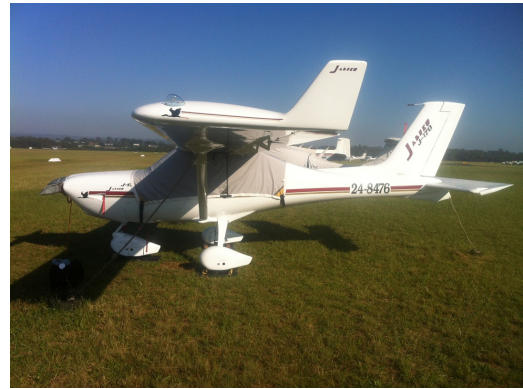
Jabiru 170 Canopy Cover