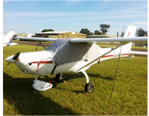
Jabiru 170 Canopy Cover