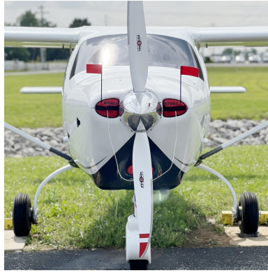
Jabiru J230-SP Engine Inlet Plugs