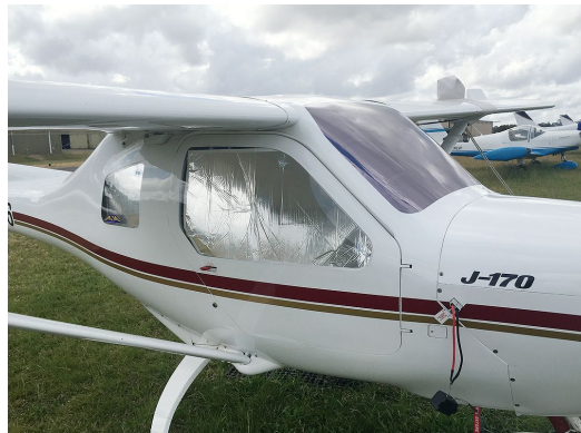
Jabiru 170 Heatshield Set

Heatshields are interior sunshades for an aircraft's windows or canopy glass. The product is a unique composite of closed-cell foam with a silver mylar finish. The semi-rigid design is stiff enough to stand along the inside of the windshield using sun visors or window framing. It folds up flat and easily stores in the included storage sleeve. Some designs may require velcro and suction cups. A Heatshield is an excellent short-term remedy for cockpit overheating.