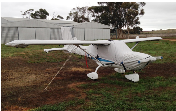
Jabiru 160 Canopy, Engine, Prop, Wings & Empennage Covers

This cover type is made from Silver Acrylic Sunbrella canvas and is 100% lined with a soft and smooth microfiber. Bruce's Custom Covers developed this material combination especially for aircraft protection. The outer material is medium weight and treated for water resistance, UV resistance and anti-static buildup. The inner lining is a very soft and smooth microfiber to prevent scratching. The material is very reflective, and tests show that the cabin interior temperature can be reduced to near-ambient temperature on the hottest of days. It is water, ice and snow repellent, yet breathable to allow moisture to escape from between the cover and the aircraft surface.