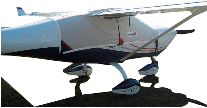
Jabiru 230-SP Canopy Cover, Over-top style

This cover type is made from Silver Acrylic Sunbrella canvas and is 100% lined with a soft and smooth microfiber. Bruce's Custom Covers developed this material combination especially for aircraft protection. The outer material is medium weight and treated for water resistance, UV resistance and anti-static buildup. The inner lining is a very soft and smooth microfiber to prevent scratching. The material is very reflective, and tests show that the cabin interior temperature can be reduced to near-ambient temperature on the hottest of days. It is water, ice and snow repellent, yet breathable to allow moisture to escape from between the cover and the aircraft surface.