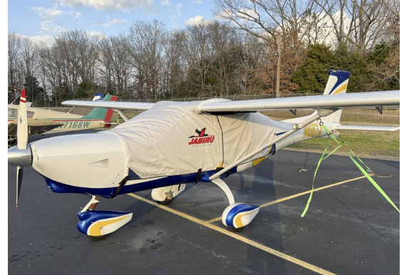
Jabiru J230-SP Extended Canopy Cover