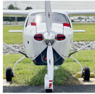
Jabiru J230-SP Engine Inlet Plugs