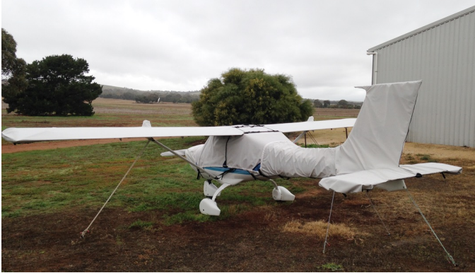
Jabiru 160 Canopy, Engine, Prop, Wings &amp; Empennage Covers

Designed to prevent damage to the aircraft extremities in crowded hangars, these products are made of bright red Naugahyde and thickly padded with a sandwich of closed cell foam.