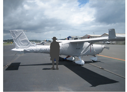
Jabiru J430 Complete Cover Set