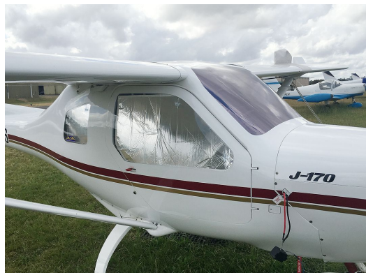
Jabiru 170 Heatshield Set