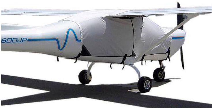
Jabiru Extended Canopy Cover