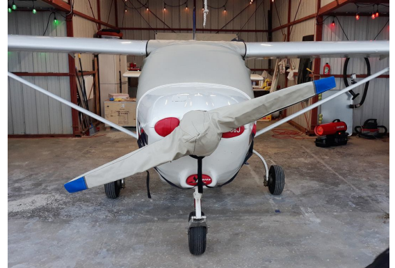
Jabiru J250 Canopy & Prop Cover