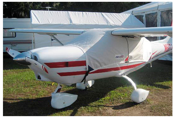
Jabiru 230-SP Canopy Cover, Over-top style