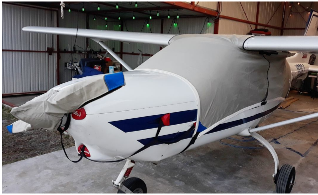
Jabiru J250 Canopy & Prop Cover