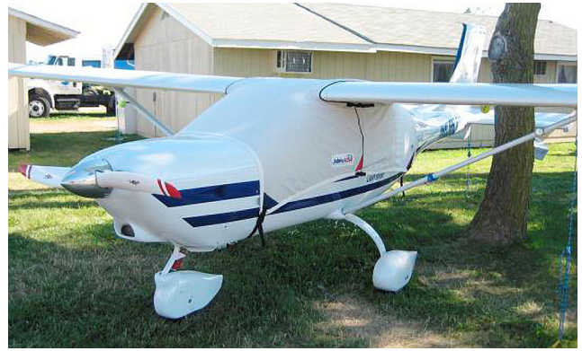
Jabiru 250 Standard Canopy Cover