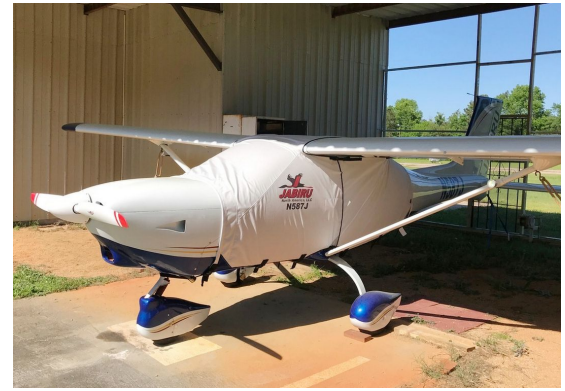
Jabiru J250-SP Canopy Cover