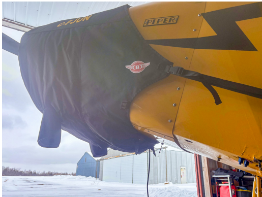
Piper J3 Cub Insulated Engine Cover