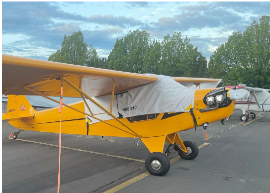
Piper J3 Canopy Cover, Prop Cover