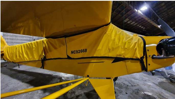
Piper J3 Over The Top Style Canopy Cover & Empennage Cover

WINTER USE MATERIAL - Made with Solution-Dyed Polyester fabric, this option is intended for seasonal use to aid in deicing, rain mitigation, or for occasional travel. The material is lighter and more compact, but more susceptible to UV damage and may have a shorter useful life if used continuously outside than the all-year use material.