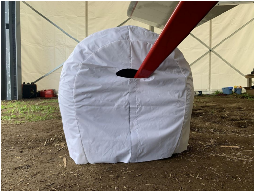
Piper PA-18 Super Cub Extended Canopy Cover, Wing & Tire Covers Cub Crafters CC19 Oversize Tire Covers, test fit cover