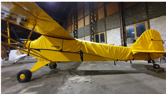
Piper J3 Over The Top Style Canopy Cover & Empennage Cover

This cover type is made from Silver Acrylic Sunbrella canvas and is 100% lined with a soft and smooth microfiber. Bruce's Custom Covers developed this material combination especially for aircraft protection. The outer material is medium weight and treated for water resistance, UV resistance and anti-static buildup. The inner lining is a very soft and smooth microfiber to prevent scratching. The material is very reflective, and tests show that the cabin interior temperature can be reduced to near-ambient temperature on the hottest of days. It is water, ice and snow repellent, yet breathable to allow moisture to escape from between the cover and the aircraft surface.