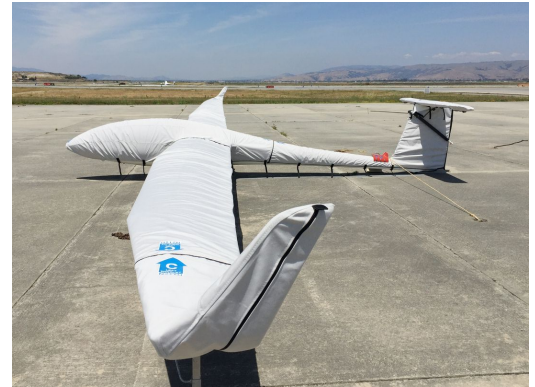
Schempp-Hirth Discus 2B Full Cover Set