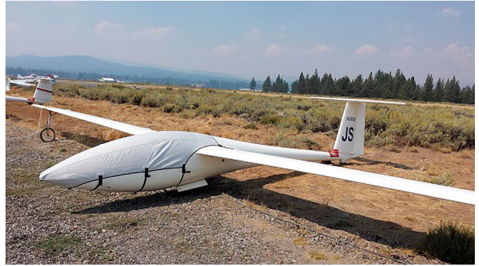
ASW-20C Canopy/Nose Cover