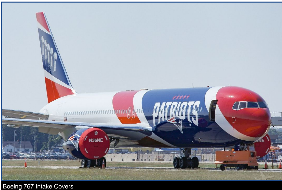
Boeing 767 Intake Covers