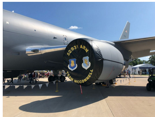
Boeing KC-46 Intake Cover