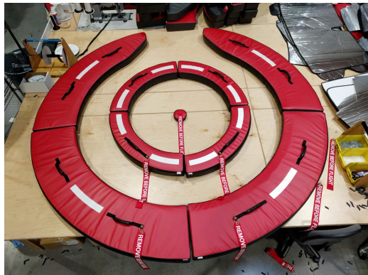
Boeing 747-8 Exhaust Plugs

The Engine Inlet Plugs are custom fit for your Boeing KC-46, KC-46A, Pegasus intakes, made with heavy-duty vinyl material, and stuffed with a single block of sculpted urethane foam. Each plug has a zipper that allows the foam to be removed and dried if necessary. Engine plugs have 'remove before flight' streamers sewn onto the face of the plugs. Most plugs are imprinted with the aircraft registration number in black for an extra charge. Storage bag NOT included. Engine plugs may be inserted after flight when the engine is still warm. Engine Inlet Plugs are commonly referred to as Cowl Plugs, Intake Plugs, Cowl Blocks, Engine Blocks, and Engine Bung.