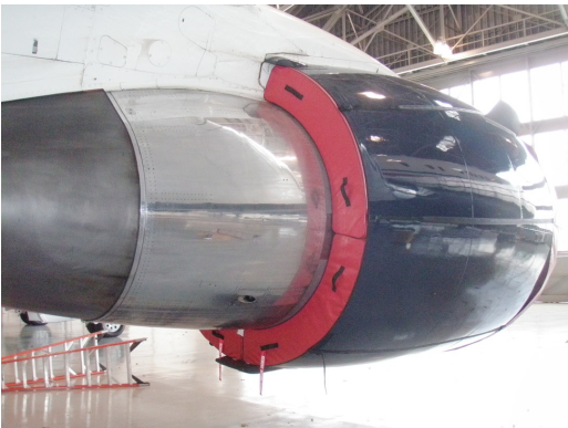
Boeing 767 Exhaust Plugs Ship Set, incl. Fan Thrust Reverser and Exhaust Plugs P/N: B767-200