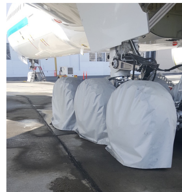
Boeing 777 Main & Nose Gear Tire Covers