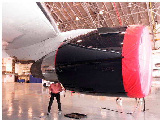
Boeing 767 Intake Covers Ship Set