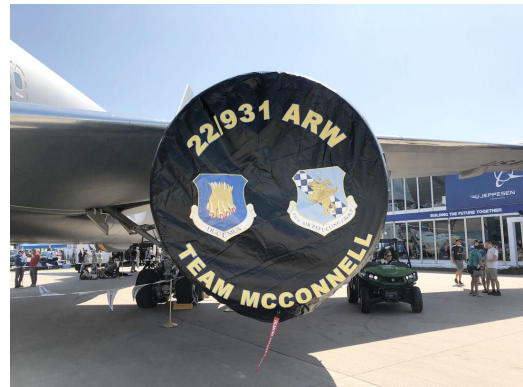
Boeing KC-46 Intake Cover