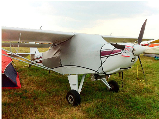
Kitfox Spandex FlyAway Travel Canopy Cover

non-travel Sunbrella Cover is the best choice.