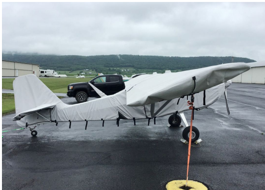
Kitfox 5 Complete Cover Set