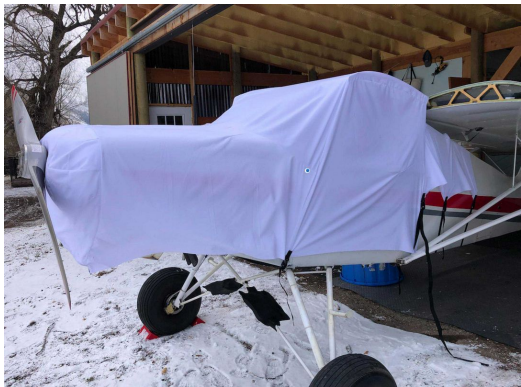
Kitfox Trailable Canopy/Engine Cover, test fit cover

This cover type is made from Silver Acrylic Sunbrella canvas and is 100% lined with a soft and smooth microfiber. Bruce's Custom Covers developed this material combination especially for aircraft protection. The outer material is medium weight and treated for water resistance, UV resistance and anti-static buildup. The inner lining is a very soft and smooth microfiber to prevent scratching. The material is very reflective, and tests show that the cabin interior temperature can be reduced to near-ambient temperature on the hottest of days. It is water, ice and snow repellent, yet breathable to allow moisture to escape from between the cover and the aircraft surface.