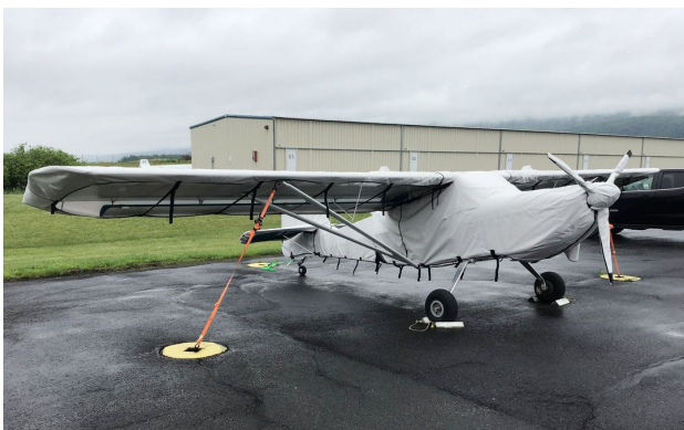
Kitfox 5 Complete Cover Set

WINTER USE MATERIAL - Made with Solution-Dyed Polyester fabric, this option is intended for seasonal use to aid in deicing, rain mitigation, or for occasional travel. The material is lighter and more compact, but more susceptible to UV damage and may have a shorter useful life if used continuously outside than the all-year use material.