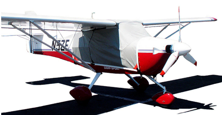
Aerotrek A240 Standard Canopy Cover