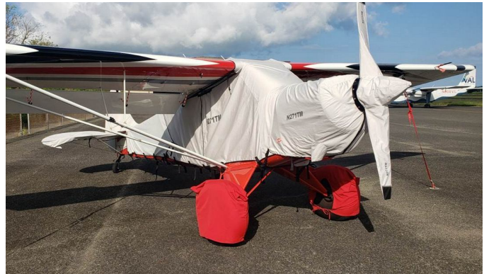
Aviat Husky Extended Canopy Cover, Engine, Prop, Empennage & Tire Covers