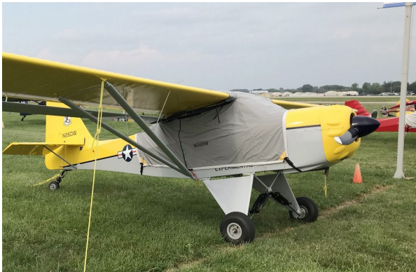
Kitfox Travel Canopy Cover