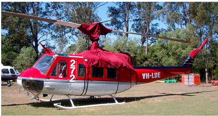
Bell 204/205 Engine/Mid-Cabin Cover, Main & Tail Rotor Covers