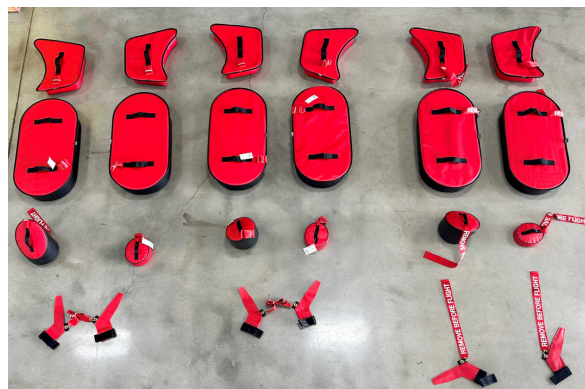
Sikorsky UH-60A Plug Set