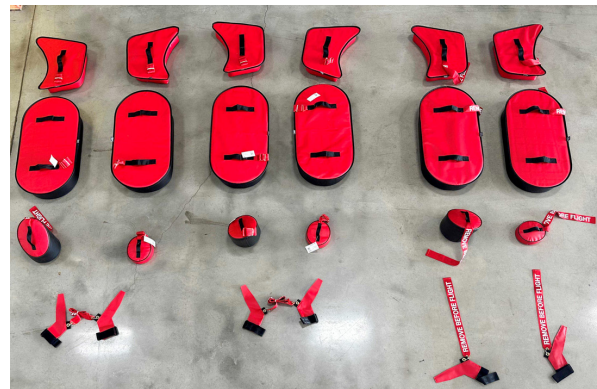
Sikorsky UH-60A Plug Set