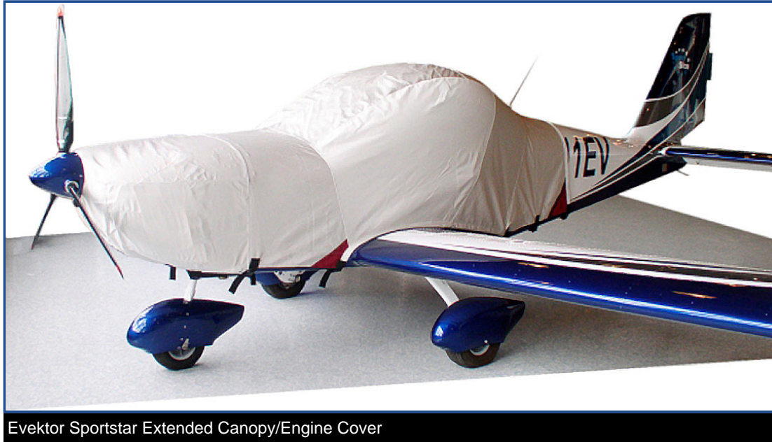
Evektor Sportstar Extended Canopy/Engine Cover