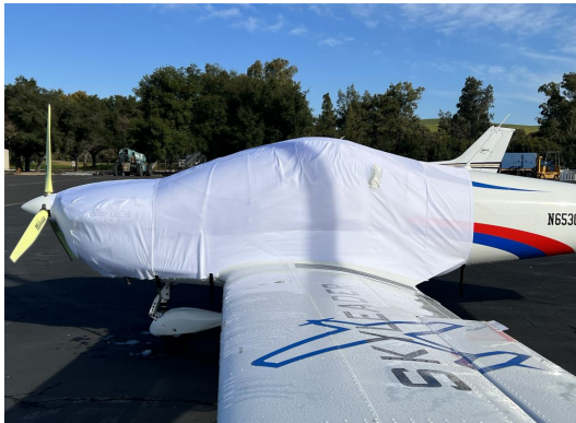
Jihlavan JA-600 Skyleader Extended Canopy/Engine Cover, test fit cover

This cover type is made from Silver Acrylic Sunbrella canvas and is 100% lined with a soft and smooth microfiber. Bruce's Custom Covers developed this material combination especially for aircraft protection. The outer material is medium weight and treated for water resistance, UV resistance and anti-static buildup. The inner lining is a very soft and smooth microfiber to prevent scratching. The material is very reflective, and tests show that the cabin interior temperature can be reduced to near-ambient temperature on the hottest of days. It is water, ice and snow repellent, yet breathable to allow moisture to escape from between the cover and the aircraft surface.