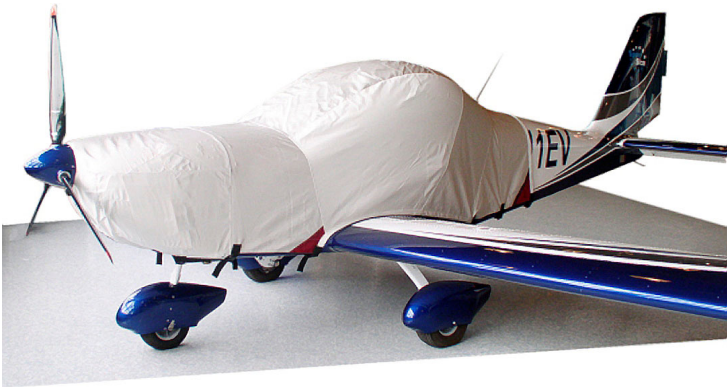
Evekotor Sportstar Extended Canopy/Engine Cover