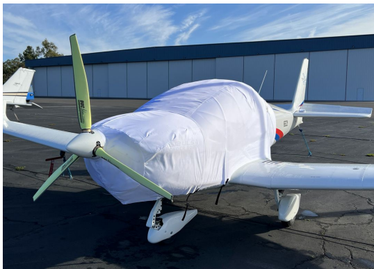
Jihlavan JA-600 Skylander Extended Canopy/Engine Cover, test fit cover

This cover type is made from Silver Acrylic Sunbrella canvas and is 100% lined with a soft and smooth microfiber. Bruce's Custom Covers developed this material combination especially for aircraft protection. The outer material is medium weight and treated for water resistance, UV resistance and anti-static buildup. The inner lining is a very soft and smooth microfiber to prevent scratching. The material is very reflective, and tests show that the cabin interior temperature can be reduced to near-ambient temperature on the hottest of days. It is water, ice and snow repellent, yet breathable to allow moisture to escape from between the cover and the aircraft surface.