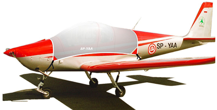
Kappa KP-5 Canopy Cover (illustration)