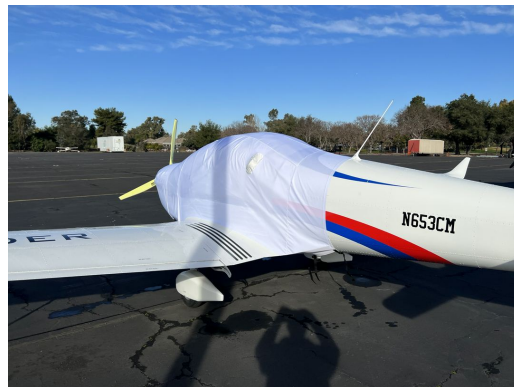
test fit cover