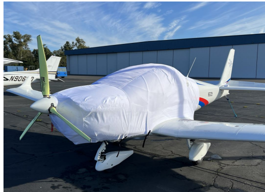
Jihlavan JA-600 Skyleader Extended Canopy/Engine Cover, test fit cover