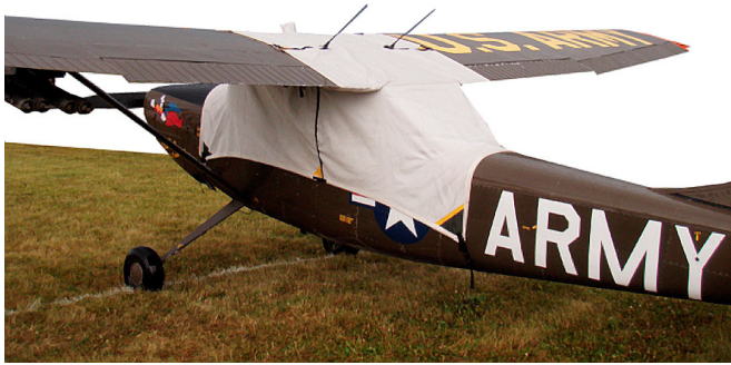
L-19 Canopy Cover

water resistance, UV resistance and anti-static buildup. The inner lining is a very soft and smooth microfiber to prevent scratching. The material is very reflective, and tests show that the cabin interior temperature can be reduced to near-ambient temperature on the hottest of days. It is water, ice and snow repellent, yet breathable to allow moisture to escape from between the cover and the aircraft surface.