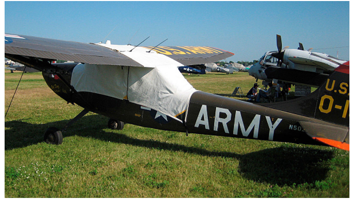
L-19 Canopy Cover