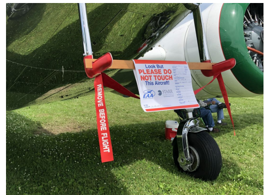
Lockheed 12 Pitot Covers