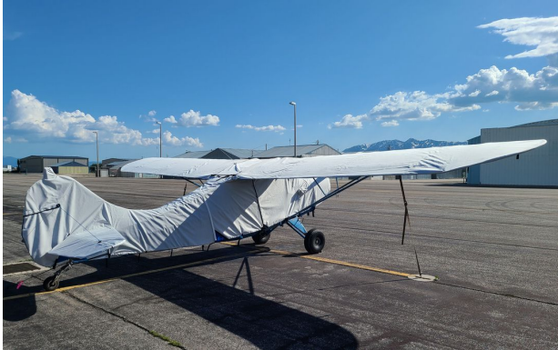
Champion 7EC Complete Cover Set

This cover type is made from Silver Acrylic Sunbrella canvas and is 100% lined with a soft and smooth microfiber. Bruce's Custom Covers developed this material combination especially for aircraft protection. The outer material is medium weight and treated for water resistance, UV resistance and anti-static buildup. The inner lining is a very soft and smooth microfiber to prevent scratching. The material is very reflective, and tests show that the cabin interior temperature can be reduced to near-ambient temperature on the hottest of days. It is water, ice and snow repellent, yet breathable to allow moisture to escape from between the cover and the aircraft surface.