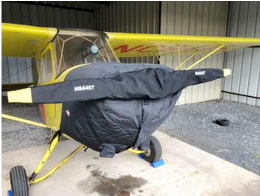
Aeronca Champ Insulated Engine & Prop Covers

This cover type is made from Silver Acrylic Sunbrella canvas and is 100% lined with a soft and smooth microfiber. Bruce's Custom Covers developed this material combination especially for aircraft protection. The outer material is medium weight and treated for water resistance, UV resistance and anti-static buildup. The inner lining is a very soft and smooth microfiber to prevent scratching. The material is very reflective, and tests show that the cabin interior temperature can be reduced to near-ambient temperature on the hottest of days. It is water, ice and snow repellent, yet breathable to allow moisture to escape from between the cover and the aircraft surface.