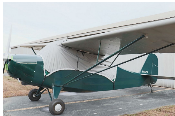
Aeronca 7AC Over-Top Canopy Cover, Light Weight Travel Type