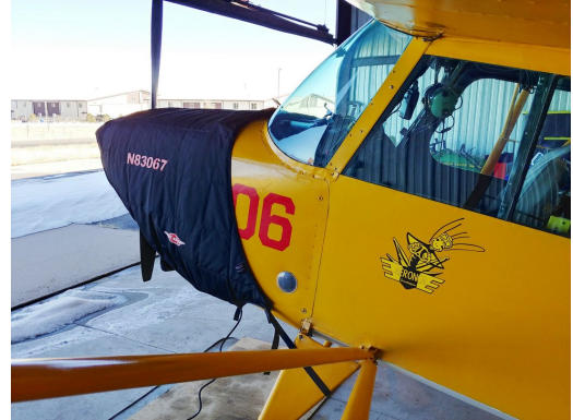
Aeronca Champ 7AC Insulated Engine Cover