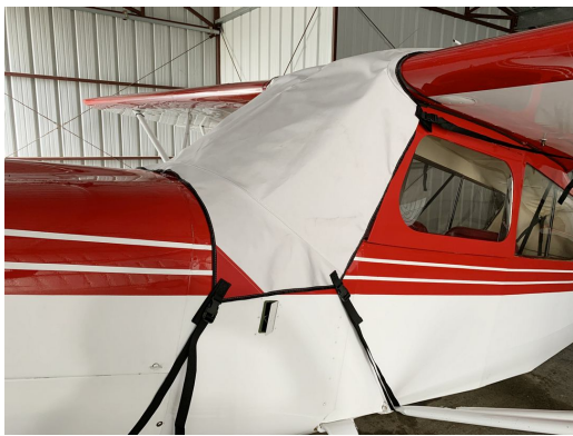
Bellanca Citabria Windshield/Skylight Cover