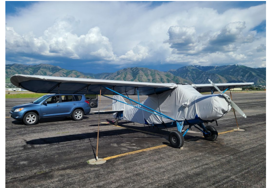
Champion 7EC Complete Cover Set