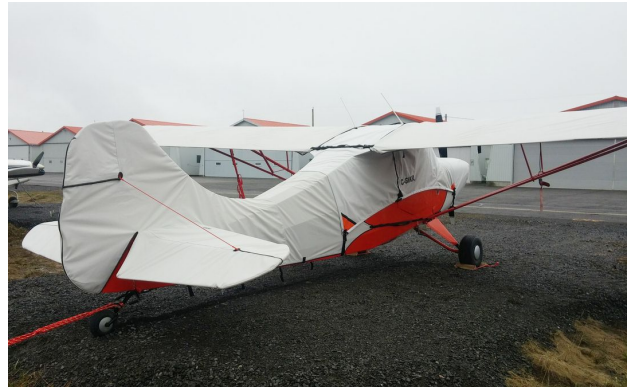
Aeronca Champ 7EC Canopy, Engine, Wing & Empennage Covers