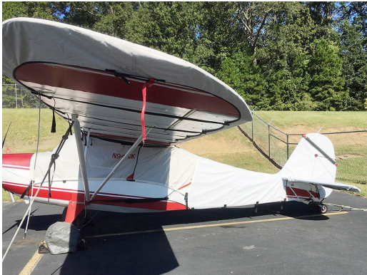
Aeronca Champ 7AC/7EC Wing and Empennage Covers

WINTER USE MATERIAL - Made with Solution-Dyed Polyester fabric, this option is intended for seasonal use to aid in deicing, rain mitigation, or for occasional travel. The material is lighter and more compact, but more susceptible to UV damage and may have a shorter useful life if used continuously outside than the all-year use material.