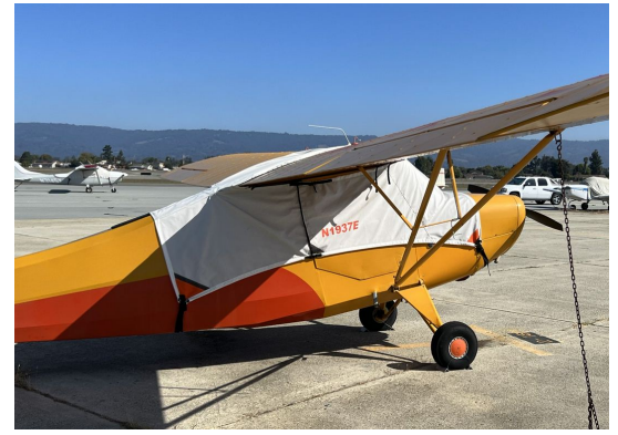
Aeronca Champ 7AC Extended Canopy, Engine, Wings & Empennage Covers Aeronca Champ 7AC Over-Top Canopy Cover