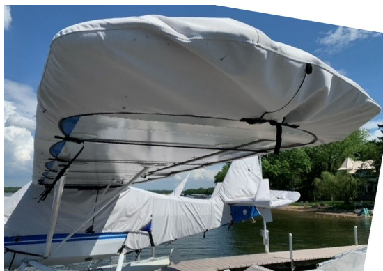
Aeronca 7GC Amphib Cover Set

WINTER USE MATERIAL - Made with Solution-Dyed Polyester fabric, this option is intended for seasonal use to aid in deicing, rain mitigation, or for occasional travel. The material is lighter and more compact, but more susceptible to UV damage and may have a shorter useful life if used continuously outside than the all-year use material.