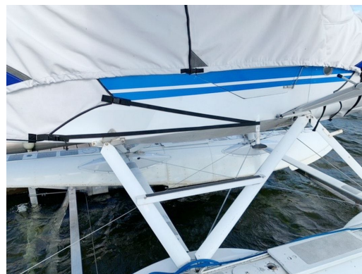
Aeronca 7GC Amphib Cover Set