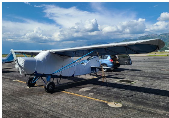
Champion 7EC Complete Cover Set