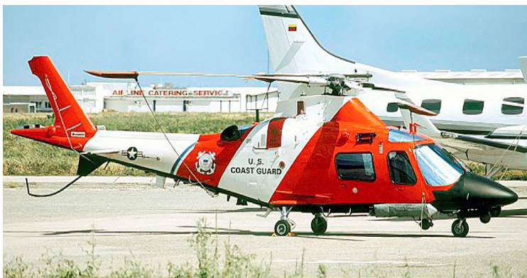
Covers, Plugs, HeatShields and related items for the Agusta MH-68A

Cabin Heatshields are interior sunshades for the aircraft's passenger cabin area. The product is a unique composite of closed-cell foam with a silver mylar finish. The semi-rigid design is stiff enough to stand inside the window framing. The set folds up flat and is easily stored in the included storage sleeve. Some designs may require velcro and suction cups. A Heatshield is an excellent short-term remedy for cockpit overheating, but an external fabric cover is more effective for long-term protection.