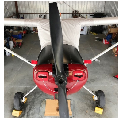
Cessna Bird Dog, L-19, O-1, 305 Engine Inlet Plugs