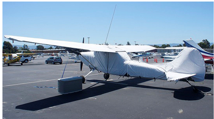
Cessna L-19 Extended Over-the-top Canopy, Engine, Empennage & Wing Covers