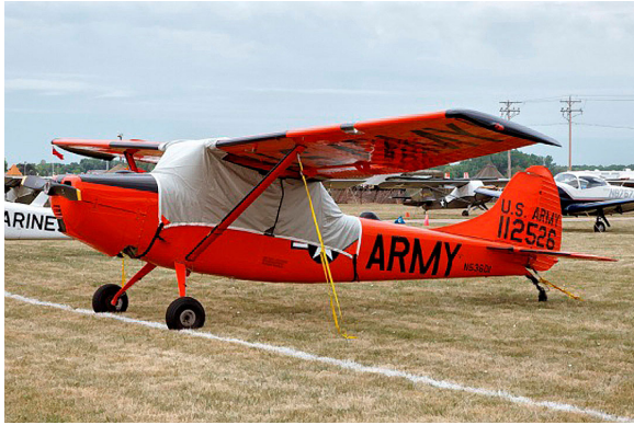
Cessna L-19 Bird Dog Canopy Cover

Covers developed this material combination especially for aircraft protection. The outer material is medium weight and treated for water resistance, UV resistance and anti-static buildup. The inner lining is a very soft and smooth microfiber to prevent scratching. The material is very reflective, and tests show that the cabin interior temperature can be reduced to near-ambient temperature on the hottest of days. It is water, ice and snow repellent, yet breathable to allow moisture to escape from between the cover and the aircraft surface.