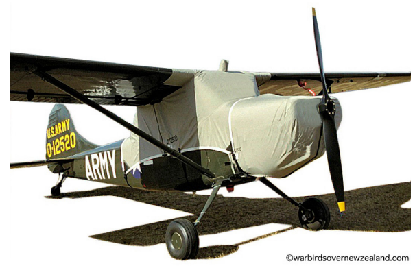
Cessna L-19 Canopy & Engine Covers