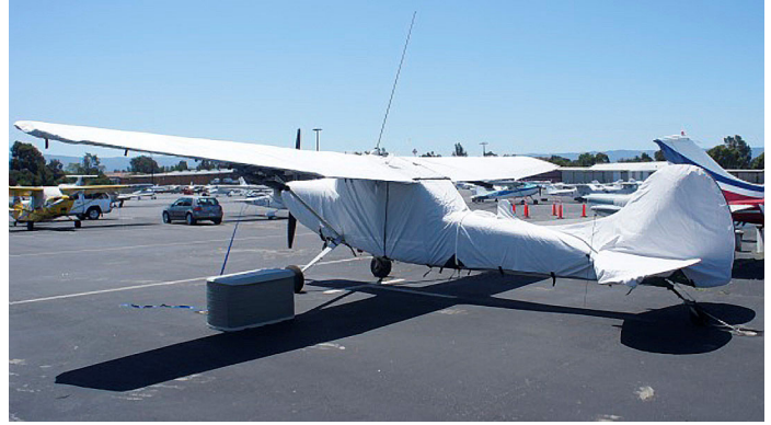
FOR INTERIOR USE. Cub Crafters CC-11 Insulated Hangar Cessna L-19 Extended Over-the-top Canopy, Engine, Empennage & Blanket, available in Red or Silver Wing Covers