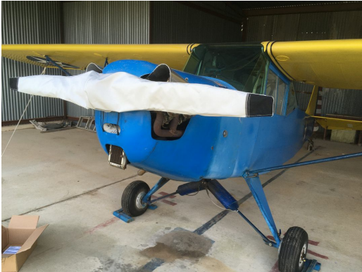
Taylorcraft L-2 Grasshopper Propellor/Spinner Cover