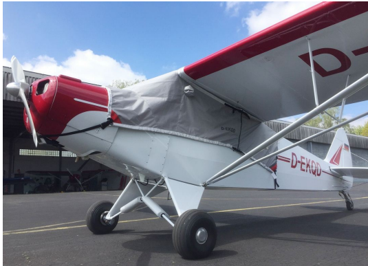
Piper Super Cub Travel Weight Canopy Cover

This cover type is made from Silver Acrylic Sunbrella canvas and is 100% lined with a soft and smooth microfiber. Bruce's Custom Covers developed this material combination especially for aircraft protection. The outer material is medium weight and treated for water resistance, UV resistance and anti-static buildup. The inner lining is a very soft and smooth microfiber to prevent scratching. The material is very reflective, and tests show that the cabin interior temperature can be reduced to near-ambient temperature on the hottest of days. It is water, ice and snow repellent, yet breathable to allow moisture to escape from between the cover and the aircraft surface.