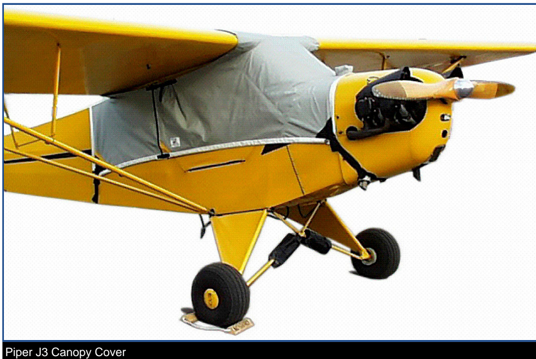
Piper J3 Canopy Cover