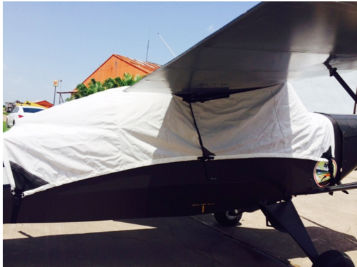
Taylorcraft L-2 Canopy Cover