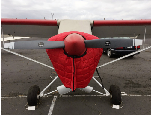
FOR INTERIOR USE. Cub Crafters CC-11 Insulated Hangar Blanket, available in Red or Silver

This cover type is made from Silver Acrylic Sunbrella canvas and is 100% lined with a soft and smooth microfiber. Bruce's Custom Covers developed this material combination especially for aircraft protection. The outer material is medium weight and treated for water resistance, UV resistance and anti-static buildup. The inner lining is a very soft and smooth microfiber to prevent scratching. The material is very reflective, and tests show that the cabin interior temperature can be reduced to near-ambient temperature on the hottest of days. It is water, ice and snow repellent, yet breathable to allow moisture to escape from between the cover and the aircraft surface.