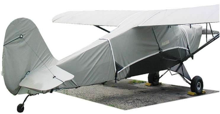
Taylorcraft L-2 Grasshopper Prop, Engine, Canopy, Wing and Empennage Covers