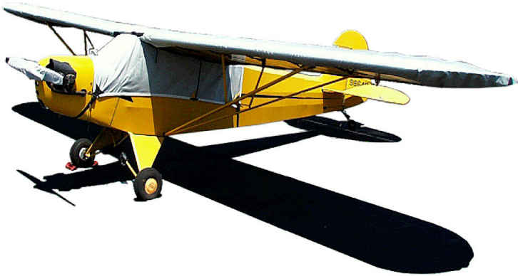
Piper J3 Canopy, Wing and Prop Covers

This cover type is made from Silver Acrylic Sunbrella canvas and is 100% lined with a soft and smooth microfiber. Bruce's Custom Covers developed this material combination especially for aircraft protection. The outer material is medium weight and treated for water resistance, UV resistance and anti-static buildup. The inner lining is a very soft and smooth microfiber to prevent scratching. The material is very reflective, and tests show that the cabin interior temperature can be reduced to near-ambient temperature on the hottest of days. It is water, ice and snow repellent, yet breathable to allow moisture to escape from between the cover and the aircraft surface.