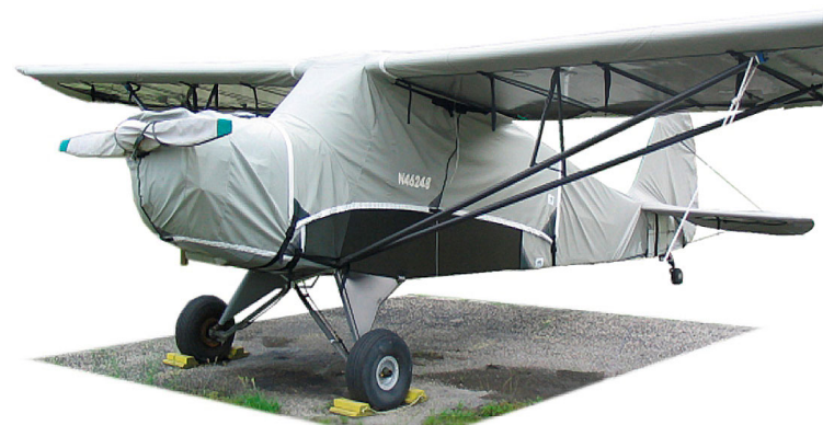
Prop Cover, Engine Cover, Canopy Cover, Wing Covers and Empennage Cover

WINTER USE MATERIAL - Made with Solution-Dyed Polyester fabric, this option is intended for seasonal use to aid in deicing, rain mitigation, or for occasional travel. The material is lighter and more compact, but more susceptible to UV damage and may have a shorter useful life if used continuously outside than the all-year use material.