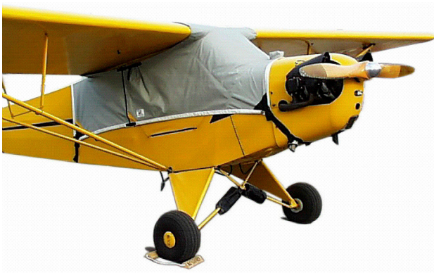
Piper J3 Canopy Cover