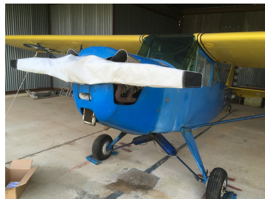
Taylorcraft L-2 Grasshopper Propellor/Spinner Cover