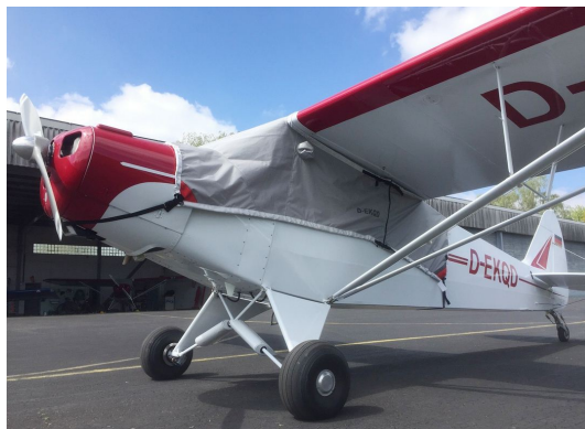
Piper Super Cub Travel Weight Canopy Cover