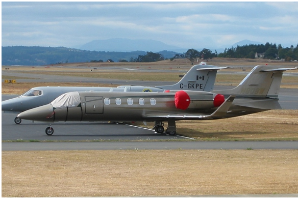
Lear 31A Cockpit Cover, Engine Covers