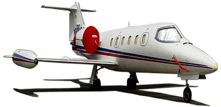
Lear 35 Engine Covers, Pitot Covers & Cockpit HeatShields