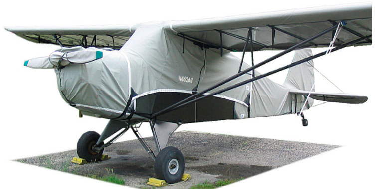
Prop Cover, Engine Cover, Canopy Cover, Wing Covers and Empennage Cover