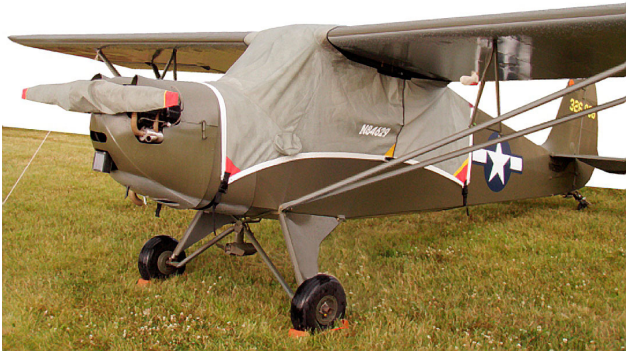
L3 Canopy Cover & Prop Cover

This cover type is made from Silver Acrylic Sunbrella canvas and is 100% lined with a soft and smooth microfiber. Bruce's Custom Covers developed this material combination especially for aircraft protection. The outer material is medium weight and treated for water resistance, UV resistance and anti-static buildup. The inner lining is a very soft and smooth microfiber to prevent scratching. The material is very reflective, and tests show that the cabin interior temperature can be reduced to near-ambient temperature on the hottest of days. It is water, ice and snow repellent, yet breathable to allow moisture to escape from between the cover and the aircraft surface.