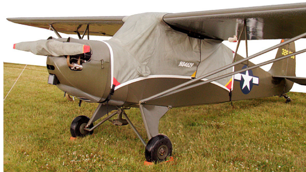
L3 Canopy Cover & Prop Cover

This cover type is made from Silver Acrylic Sunbrella canvas and is 100% lined with a soft and smooth microfiber. Bruce's Custom Covers developed this material combination especially for aircraft protection. The outer material is medium weight and treated for water resistance, UV resistance and anti-static buildup. The inner lining is a very soft and smooth microfiber to prevent scratching. The material is very reflective, and tests show that the cabin interior temperature can be reduced to near-ambient temperature on the hottest of days. It is water, ice and snow repellent, yet breathable to allow moisture to escape from between the cover and the aircraft surface.