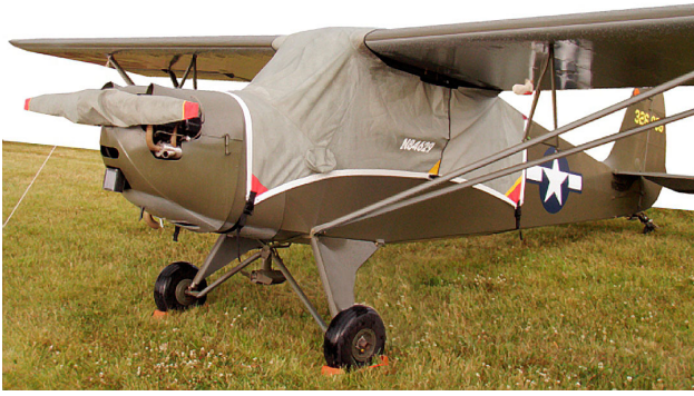
L3 Canopy Cover & Prop Cover