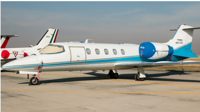
Lear 35 Engine & Pitot Covers

Cockpit Heatshields are interior sunshades for the aircraft's cockpit. The product is a unique composite of closed-cell foam with a silver mylar finish. The semi-rigid design is stiff enough to stand inside the window framing. The set folds up flat and is easily stored in the included storage sleeve. Some designs may require velcro and suction cups. Our Heatshields for jets are offered white side out because some aircraft manufacturers have issued advisories against reflective window inserts due to potential heat damage. A Heatshield is an excellent short-term remedy for cockpit overheating, but an external fabric cover is more effective for long-term protection.