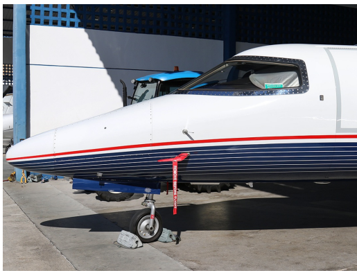
Lear Pitot Cover