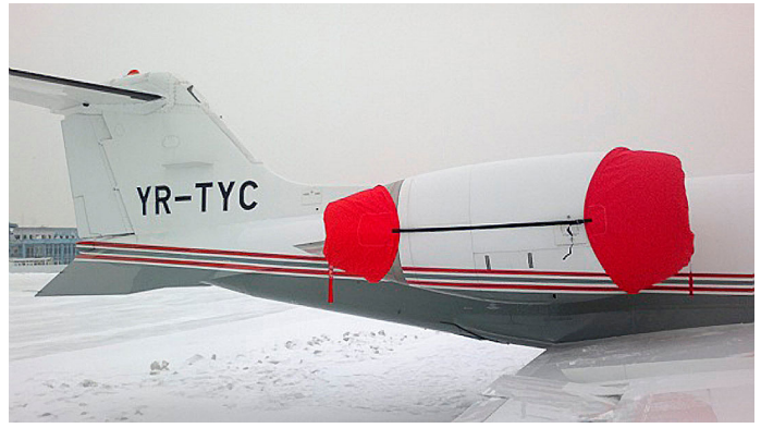
Lear 31 Engine Covers