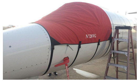
Learjet 45 Cockpit Cover