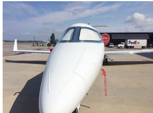
Lear Models 40 & 45 Cockpit Heatshields, Covers All Cockpit Windows