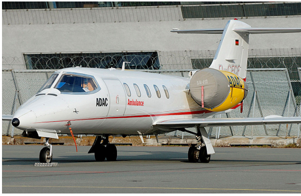
Learjet Engine Covers (come in colors)