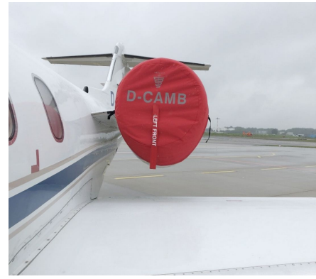
Lear 31 Intake Covers