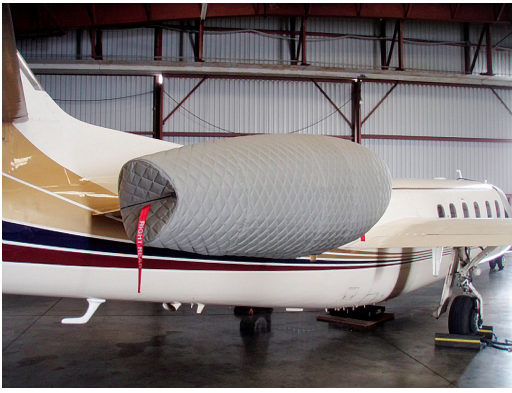
IAI Westwind 1124 Insulated Engine Nacelle Cover