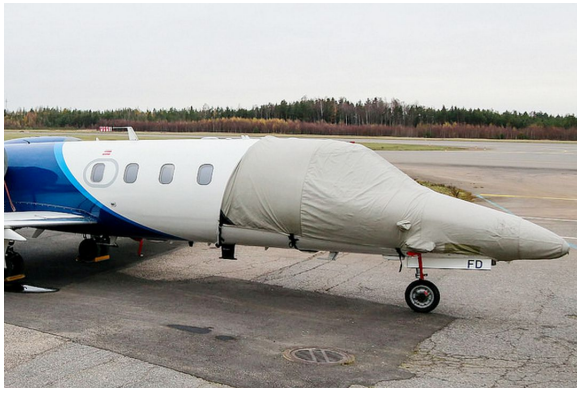
Learjet Cockpit/Nose Cover