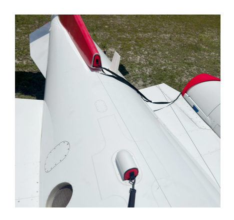
Lear 45 Dorsal, ACM & Fuel Vent Inlet Plugs