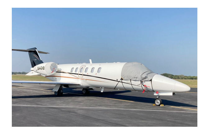
Lear 45 Light Weight Travel Cockpit Cover

This cover type is made from Silver Acrylic Sunbrella canvas and is 100% lined with a soft and smooth microfiber. Bruce's Custom Covers developed this material combination especially for aircraft protection. The outer material is medium weight and treated for water resistance, UV resistance and anti-static buildup. The inner lining is a very soft and smooth microfiber to prevent scratching. The material is very reflective, and tests show that the cabin interior temperature can be reduced to near-ambient temperature on the hottest of days. It is water, ice and snow repellent, yet breathable to allow moisture to escape from between the cover and the aircraft surface.