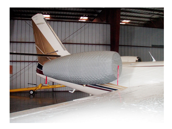
IAI Westwind Insulated Engine Nacelle Cover