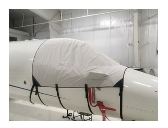
Lear 45 Cockpit Cover