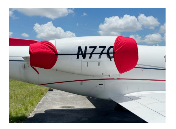
Lear 45 Engine Covers

The Lear Models 40 & 45 Bikini Style Engine Covers are a single-piece design using a soft and smooth stretchy and fabric. The cover stretches tightly over both the intake and exhaust, installing quickly and easily. These covers are designed to be used as hangar dust covers and have a useful life of approximately one year.