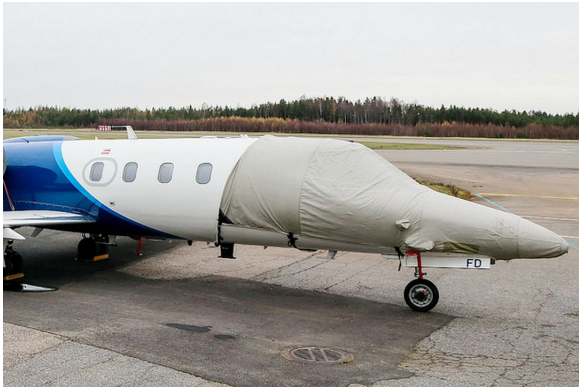
Learjet Cockpit/Nose Cover

This cover type is made from Silver Acrylic Sunbrella canvas and is 100% lined with a soft and smooth microfiber. Bruce's Custom Covers developed this material combination especially for aircraft protection. The outer material is medium weight and treated for water resistance, UV resistance and anti-static buildup. The inner lining is a very soft and smooth microfiber to prevent scratching. The material is very reflective, and tests show that the cabin interior temperature can be reduced to near-ambient temperature on the hottest of days. It is water, ice and snow repellent, yet breathable to allow moisture to escape from between the cover and the aircraft surface.