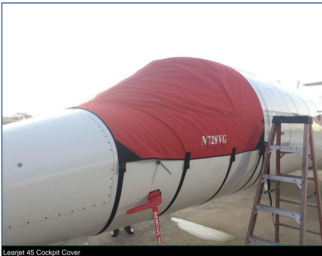
Learjet 45 Cockpit Cover