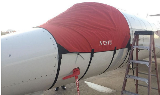
Learjet 45 Cockpit Cover

This cover type is made from Silver Acrylic Sunbrella canvas and is 100% lined with a soft and smooth microfiber. Bruce's Custom Covers developed this material combination especially for aircraft protection. The outer material is medium weight and treated for water resistance, UV resistance and anti-static buildup. The inner lining is a very soft and smooth microfiber to prevent scratching. The material is very reflective, and tests show that the cabin interior temperature can be reduced to near-ambient temperature on the hottest of days. It is water, ice and snow repellent, yet breathable to allow moisture to escape from between the cover and the aircraft surface.