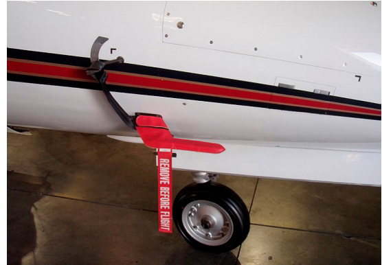
Learjet Heat Resistant Pitot Cover with AOA strap