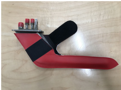
Lear 55 Pitot Cover

The Engine Inlet Plugs are custom fit for your Lear 55 intakes, made with heavy-duty vinyl material, and stuffed with a single block of sculpted urethane foam. Each plug has a zipper that allows the foam to be removed and dried if necessary. Engine plugs have 'remove before flight' streamers sewn onto the face of the plugs. Most plugs are imprinted with the aircraft registration number in black for an extra charge. Storage bag NOT included. Engine plugs may be inserted after flight when the engine is still warm. Engine Inlet Plugs are commonly referred to as Cowl Plugs, Intake Plugs, Cowl Blocks, Engine Blocks, and Engine Bungs.