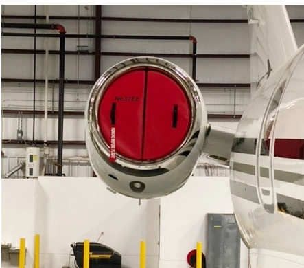
Embraer Legacy 500 Engine Inlet Plugs, folding type

The Engine Inlet Plugs are custom fit for your Embraer Legacy 500 Praetor, (EMB-545/550) intakes, made with heavy-duty vinyl material, and stuffed with a single block of sculpted urethane foam. Each plug has a zipper that allows the foam to be removed and dried if necessary. Engine plugs have 'remove before flight' streamers sewn onto the face of the plugs. Most plugs are imprinted with the aircraft registration number in black for an extra charge. Storage bag NOT included. Engine plugs may be inserted after flight when the engine is still warm. Engine Inlet Plugs are commonly referred to as Cowl Plugs, Intake Plugs, Cowl Blocks, Engine Blocks, and Engine Bungs.