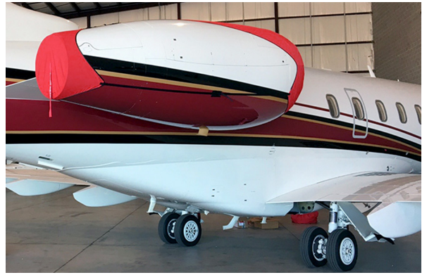
Intake/Exhaust Covers, 3-Strap Type. Successfully installed by two crew, one ladder.