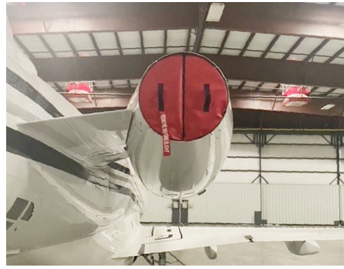
Embraer Legacy 500 Engine Exhaust Plugs, folding type