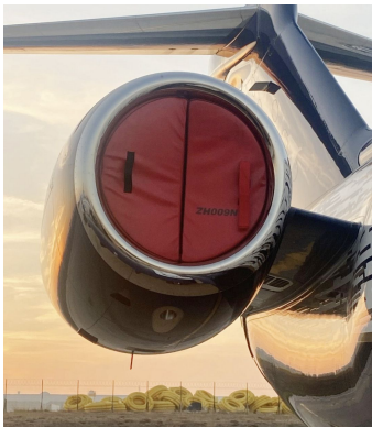
Legacy 500 Folding Intake Plugs

The Engine Inlet Plugs are custom fit for your Embraer Legacy 500 Praetor, (EMB-545/550) intakes, made with heavy-duty vinyl material, and stuffed with a single block of sculpted urethane foam. Each plug has a zipper that allows the foam to be removed and dried if necessary. Engine plugs have 'remove before flight' streamers sewn onto the face of the plugs. Most plugs are imprinted with the aircraft registration number in black for an extra charge. Storage bag NOT included. Engine plugs may be inserted after flight when the engine is still warm. Engine Inlet Plugs are commonly referred to as Cowl Plugs, Intake Plugs, Cowl Blocks, Engine Blocks, and Engine Bungs.