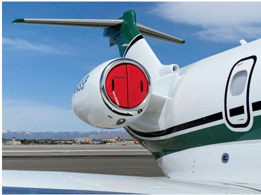
Embraer S A EMB-545 Engine Inlet & Exhaust Plug Set (folding type)

The Engine Inlet Plugs are custom fit for your Embraer Legacy 500 Praetor, (EMB-545/550) intakes, made with heavy-duty vinyl material, and stuffed with a single block of sculpted urethane foam. Each plug has a zipper that allows the foam to be removed and dried if necessary. Engine plugs have 'remove before flight' streamers sewn onto the face of the plugs. Most plugs are imprinted with the aircraft registration number in black for an extra charge. Storage bag NOT included. Engine plugs may be inserted after flight when the engine is still warm. Engine Inlet Plugs are commonly referred to as Cowl Plugs, Intake Plugs, Cowl Blocks, Engine Blocks, and Engine Bungs.