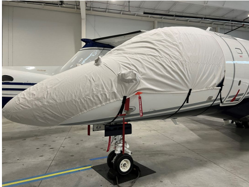
Embraer Legacy 500, (EMB-550) Cockpit/Nose Cover

This cover type is made from Silver Acrylic Sunbrella canvas and is 100% lined with a soft and smooth microfiber. Bruce's Custom Covers developed this material combination especially for aircraft protection. The outer material is medium weight and treated for water resistance, UV resistance and anti-static buildup. The inner lining is a very soft and smooth microfiber to prevent scratching. The material is very reflective, and tests show that the cabin interior temperature can be reduced to near-ambient temperature on the hottest of days. It is water, ice and snow repellent, yet breathable to allow moisture to escape from between the cover and the aircraft surface.