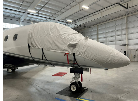
Embraer Legacy 500, (EMB-550) Cockpit/Nose Cover