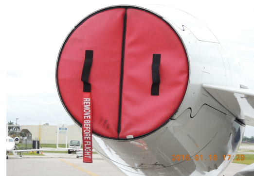
Embraer Legacy 500 Engine Exhaust Plug, folding type