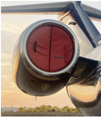
Legacy 500 Folding Intake Plugs