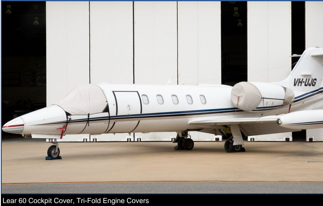
Lear 60 Cockpit Cover, Tri-Fold Engine Covers