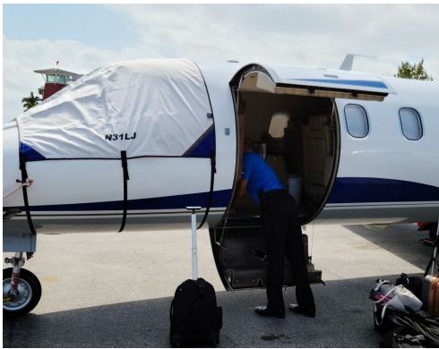
Lear 31A Cockpit Cover

This cover type is made from Silver Acrylic Sunbrella canvas and is 100% lined with a soft and smooth microfiber. Bruce's Custom Covers developed this material combination especially for aircraft protection. The outer material is medium weight and treated for water resistance, UV resistance and anti-static buildup. The inner lining is a very soft and smooth microfiber to prevent scratching. The material is very reflective, and tests show that the cabin interior temperature can be reduced to near-ambient temperature on the hottest of days. It is water, ice and snow repellent, yet breathable to allow moisture to escape from between the cover and the aircraft surface.