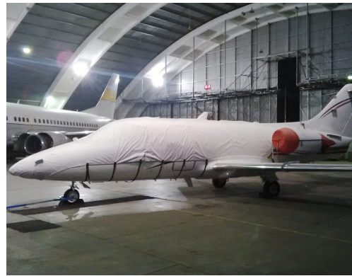
Beechjet 400 Cabin/Nose Cover, Engine Covers