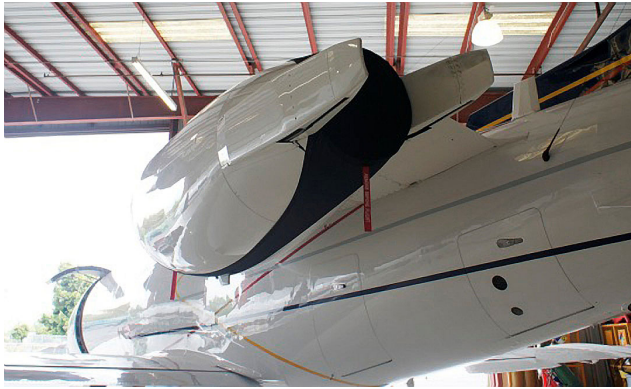
Lear 60 "Bikini Style" Engine Covers

The Lear 60 Bikini Style Engine Covers are a single-piece design using a soft and smooth stretchy fabric. The cover stretches tightly over both the intake and exhaust, installing quickly and easily. These covers are designed to be used as hangar dust covers and have a useful life of approximately one year.