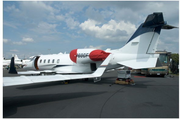
Learjet 60 Engine Cover set