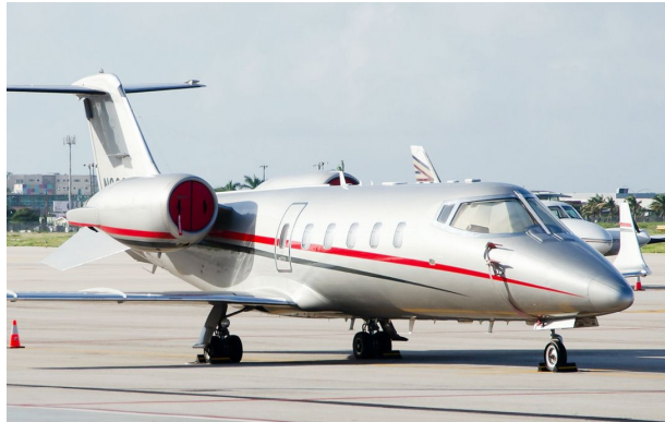
Lear 60 Cockpit Heatshields, Intake Plugs