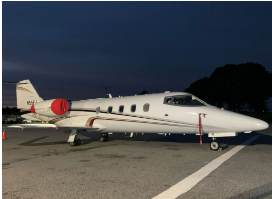
Lear 60 Cockpit Heatshields, Tri-Fold Engine Covers

Cockpit Heatshields are interior sunshades for the aircraft's cockpit. The product is a unique composite of closed-cell foam with a silver mylar finish. The semi-rigid design is stiff enough to stand inside the window framing. The set folds up flat and is easily stored in the included storage sleeve. Some designs may require velcro and suction cups. Our Heatshields for jets are offered white side out because some aircraft manufacturers have issued advisories against reflective window inserts due to potential heat damage. A Heatshield is an excellent short-term remedy for cockpit overheating, but an external fabric cover is more effective for long-term protection.