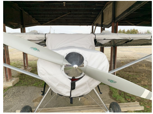
Luscombe Engine, Canopy & Wing Covers