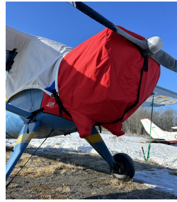
Luscombe 8A Canopy Cover, Insulated Engine Cover Luscombe 8E Canopy Cover w/Wing Extensions, Insulated Engine Cover