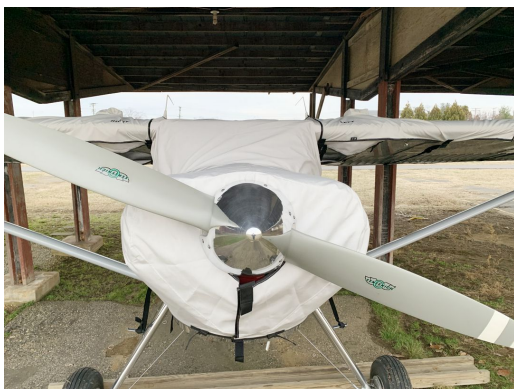
Luscombe Engine, Canopy & Wing Covers

This cover type is made from Silver Acrylic Sunbrella canvas and is 100% lined with a soft and smooth microfiber. Bruce's Custom Covers developed this material combination especially for aircraft protection. The outer material is medium weight and treated for water resistance, UV resistance and anti-static buildup. The inner lining is a very soft and smooth microfiber to prevent scratching. The material is very reflective, and tests show that the cabin interior temperature can be reduced to near-ambient temperature on the hottest of days. It is water, ice and snow repellent, yet breathable to allow moisture to escape from between the cover and the aircraft surface.