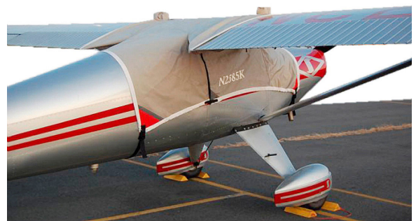
Luscomb Over-Top Canopy Cover