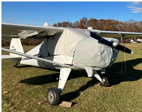
Luscombe 8A Canopy Cover, Insulated Engine Cover

This cover type is made from Silver Acrylic Sunbrella canvas and is 100% lined with a soft and smooth microfiber. Bruce's Custom Covers developed this material combination especially for aircraft protection. The outer material is medium weight and treated for water resistance, UV resistance and anti-static buildup. The inner lining is a very soft and smooth microfiber to prevent scratching. The material is very reflective, and tests show that the cabin interior temperature can be reduced to near-ambient temperature on the hottest of days. It is water, ice and snow repellent, yet breathable to allow moisture to escape from between the cover and the aircraft surface.