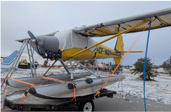
Luscombe 8A-8F Silvaire Winter Cover Set

WINTER USE MATERIAL - Made with Solution-Dyed Polyester fabric, this option is intended for seasonal use to aid in deicing, rain mitigation, or for occasional travel. The material is lighter and more compact, but more susceptible to UV damage and may have a shorter useful life if used continuously outside than the all-year use material.