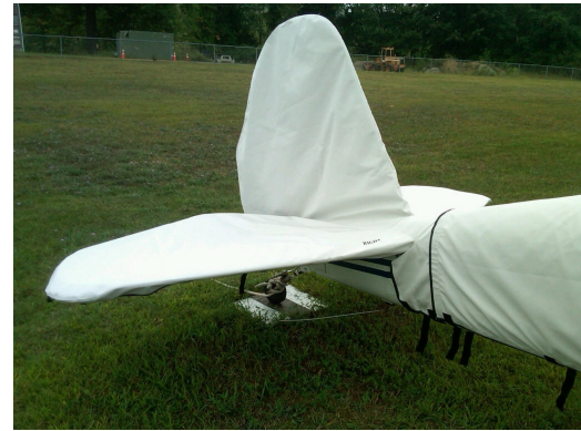
Luscombe Empennage Cover, two-piece design