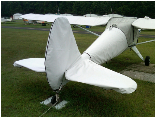
Luscombe Empennage Cover, two-piece design