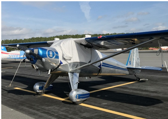
Luscombe Model 8 Over-Top Canopy Cover, extends to cover wing tanks.

This cover type is made from Silver Acrylic Sunbrella canvas and is 100% lined with a soft and smooth microfiber. Bruce's Custom Covers developed this material combination especially for aircraft protection. The outer material is medium weight and treated for water resistance, UV resistance and anti-static buildup. The inner lining is a very soft and smooth microfiber to prevent scratching. The material is very reflective, and tests show that the cabin interior temperature can be reduced to near-ambient temperature on the hottest of days. It is water, ice and snow repellent, yet breathable to allow moisture to escape from between the cover and the aircraft surface.