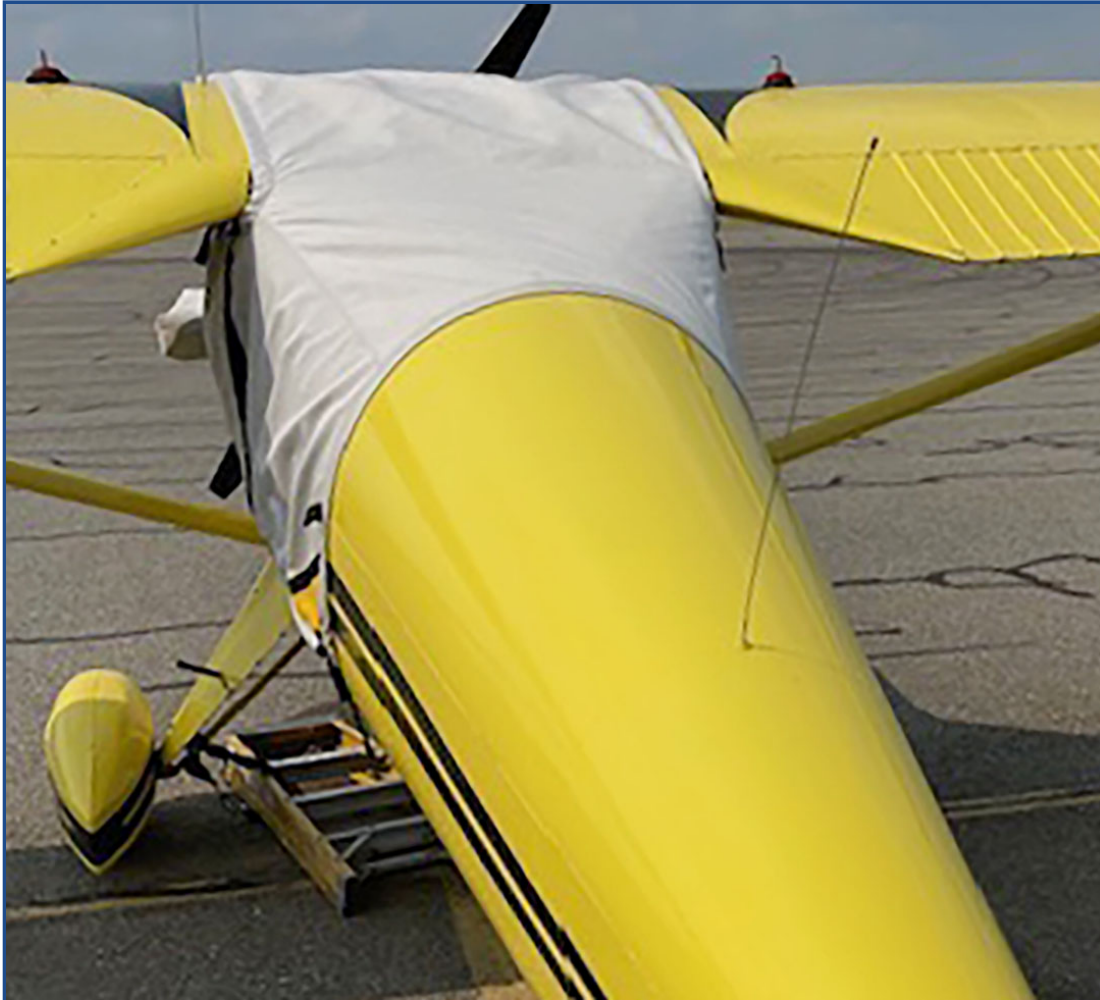
Luscombe 8A Canopy Cover, Over-Top