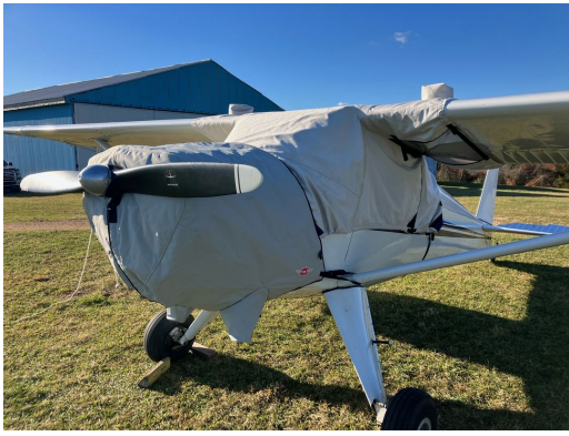
Luscombe 8A Canopy Cover, Insulated Engine Cover