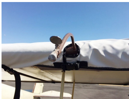
Luscombe 8A-8F Silvaire Wing Covers, Pitot Tube detail.