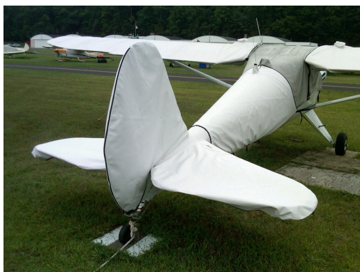
Luscombe Empennage Cover, two-piece design