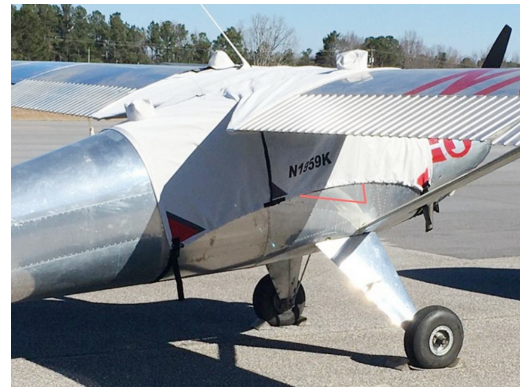
Luscombe Over-Top Canopy Cover