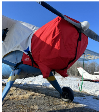
Luscombe 8E Canopy Cover w/Wing Extensions, Insulated Engine Cover

This cover type is made from Silver Acrylic Sunbrella canvas and is 100% lined with a soft and smooth microfiber. Bruce's Custom Covers developed this material combination especially for aircraft protection. The outer material is medium weight and treated for water resistance, UV resistance and anti-static buildup. The inner lining is a very soft and smooth microfiber to prevent scratching. The material is very reflective, and tests show that the cabin interior temperature can be reduced to near-ambient temperature on the hottest of days. It is water, ice and snow repellent, yet breathable to allow moisture to escape from between the cover and the aircraft surface.