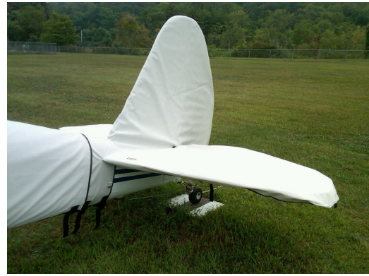
Luscombe Empennage Cover, two-piece design