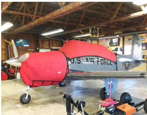
Beech T34 Mentor Canopy Cover, Insulated Engine Cover

This cover type is made from Silver Acrylic Sunbrella canvas and is 100% lined with a soft and smooth microfiber. Bruce's Custom Covers developed this material combination especially for aircraft protection. The outer material is medium weight and treated for water resistance, UV resistance and anti-static buildup. The inner lining is a very soft and smooth microfiber to prevent scratching. The material is very reflective, and tests show that the cabin interior temperature can be reduced to near-ambient temperature on the hottest of days. It is water, ice and snow repellent, yet breathable to allow moisture to escape from between the cover and the aircraft surface.