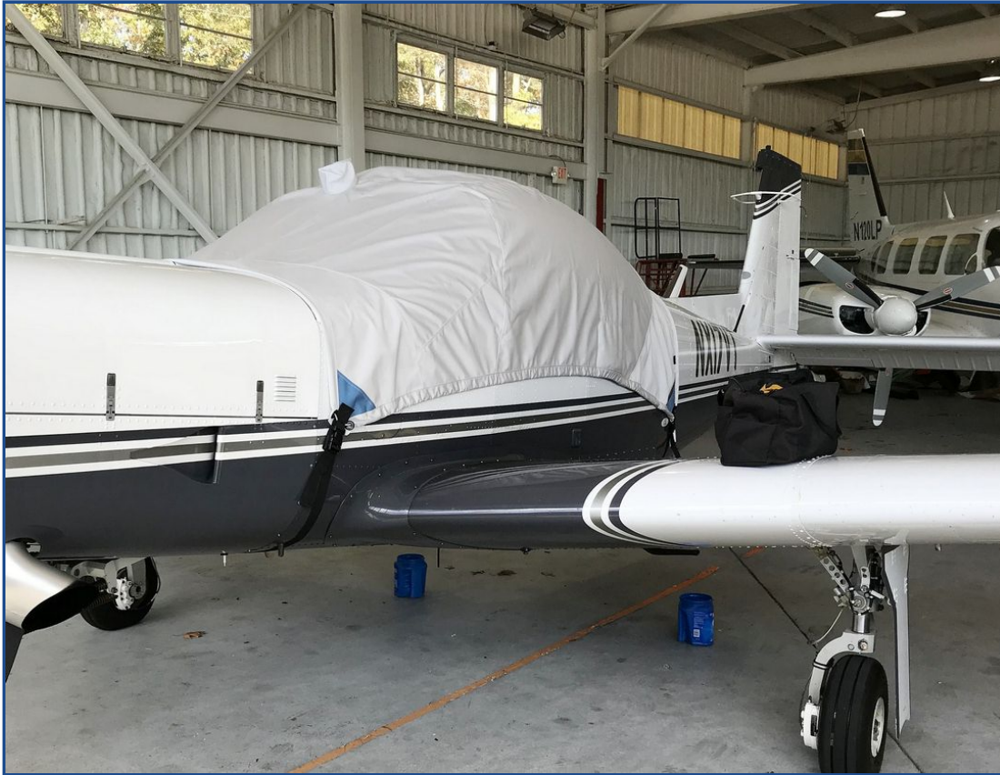
Valmet L-90 Canopy Cover