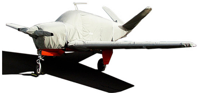
Beech Bonanza Full Cover Set