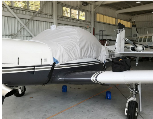
Valmet L-90 Canopy Cover

This cover type is made from Silver Acrylic Sunbrella canvas and is 100% lined with a soft and smooth microfiber. Bruce's Custom Covers developed this material combination especially for aircraft protection. The outer material is medium weight and treated for water resistance, UV resistance and anti-static buildup. The inner lining is a very soft and smooth microfiber to prevent scratching. The material is very reflective, and tests show that the cabin interior temperature can be reduced to near-ambient temperature on the hottest of days. It is water, ice and snow repellent, yet breathable to allow moisture to escape from between the cover and the aircraft surface.