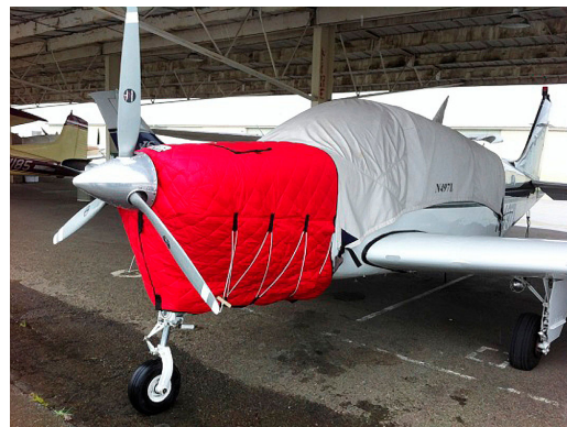
Beech Bonanza Insulated Engine Cover, fully enclosed