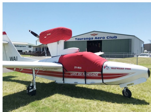
Lake Renegade Cabin & Engine Covers