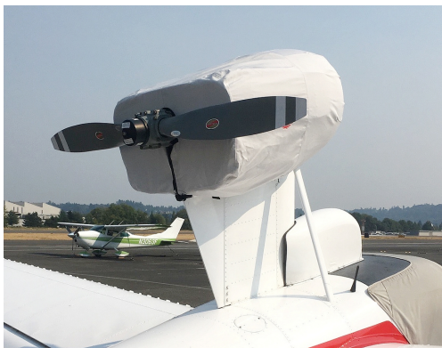
Lake LA-4 Buccaneer Engine Cover

This cover type is made from Silver Acrylic Sunbrella canvas and is 100% lined with a soft and smooth microfiber. Bruce's Custom Covers developed this material combination especially for aircraft protection. The outer material is medium weight and treated for water resistance, UV resistance and anti-static buildup. The inner lining is a very soft and smooth microfiber to prevent scratching. The material is very reflective, and tests show that the cabin interior temperature can be reduced to near-ambient temperature on the hottest of days. It is water, ice and snow repellent, yet breathable to allow moisture to escape from between the cover and the aircraft surface.