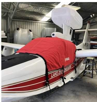
Lake LA250 Renegade Cockpit Cover, Engine Cover (test fit)

This cover type is made from Silver Acrylic Sunbrella canvas and is 100% lined with a soft and smooth microfiber. Bruce's Custom Covers developed this material combination especially for aircraft protection. The outer material is medium weight and treated for water resistance, UV resistance and anti-static buildup. The inner lining is a very soft and smooth microfiber to prevent scratching. The material is very reflective, and tests show that the cabin interior temperature can be reduced to near-ambient temperature on the hottest of days. It is water, ice and snow repellent, yet breathable to allow moisture to escape from between the cover and the aircraft surface.