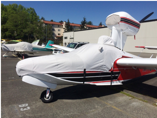
Lake LA-4 Canopy/Nose Cover