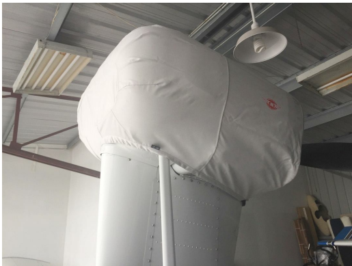
Lake LA-4 Buccaneer Engine Cover