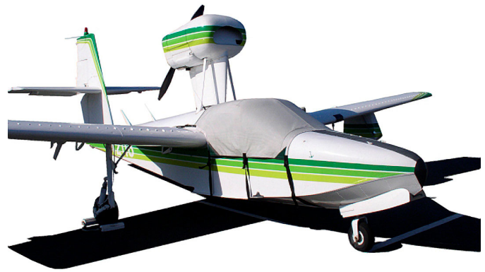
Lake LA-250 Canopy Cover