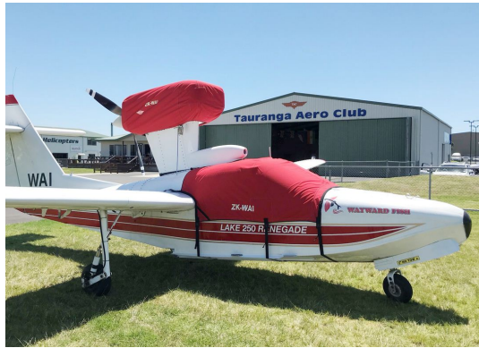
Lake Renegade Cabin & Engine Covers

This cover type is made from Silver Acrylic Sunbrella canvas and is 100% lined with a soft and smooth microfiber. Bruce's Custom Covers developed this material combination especially for aircraft protection. The outer material is medium weight and treated for water resistance, UV resistance and anti-static buildup. The inner lining is a very soft and smooth microfiber to prevent scratching. The material is very reflective, and tests show that the cabin interior temperature can be reduced to near-ambient temperature on the hottest of days. It is water, ice and snow repellent, yet breathable to allow moisture to escape from between the cover and the aircraft surface.