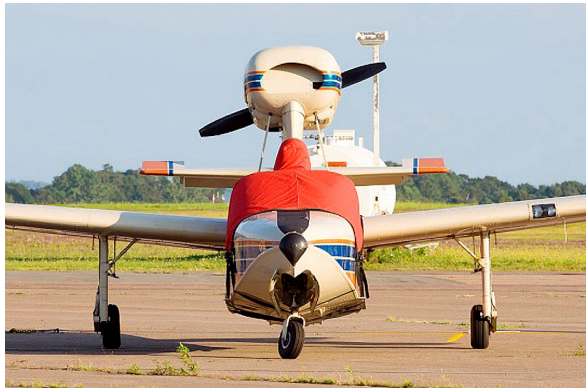
Lake LA-4 Canopy Cover