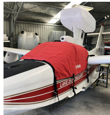
Lake LA250 Renegade Cockpit Cover, Engine Cover (test fit)