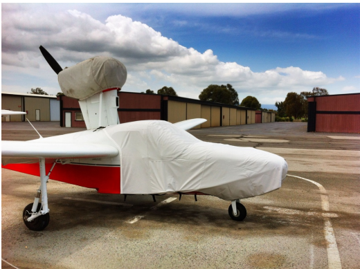
Lake Canopy/Nose Cover (fully enclosed), Engine Cover

This cover type is made from Silver Acrylic Sunbrella canvas and is 100% lined with a soft and smooth microfiber. Bruce's Custom Covers developed this material combination especially for aircraft protection. The outer material is medium weight and treated for water resistance, UV resistance and anti-static buildup. The inner lining is a very soft and smooth microfiber to prevent scratching. The material is very reflective, and tests show that the cabin interior temperature can be reduced to near-ambient temperature on the hottest of days. It is water, ice and snow repellent, yet breathable to allow moisture to escape from between the cover and the aircraft surface.