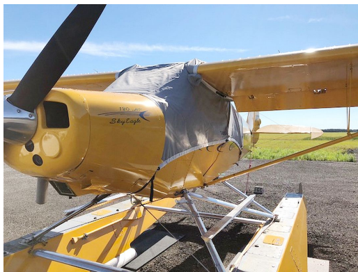
Sportsman 2+2 Wag Aero Light Weight Over the Top Travel Canopy Cover

Travel Covers are made with Silver Solution-Dyed Polyester fabric and only lined over the windshield to save weight. The material is lightweight and more compact for easy stowage in the aircraft. The polyester material is water resistant, but only intended for occasional use outside. We also have an ultra lightweight material available for fitted hangar dust covers. For daily outdoor use, the non-travel Sunbrella Cover is the best choice.