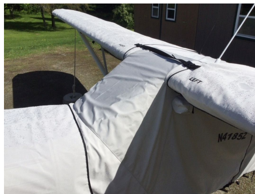
Piper PA-18-150 Super Cub Complete Cover Set