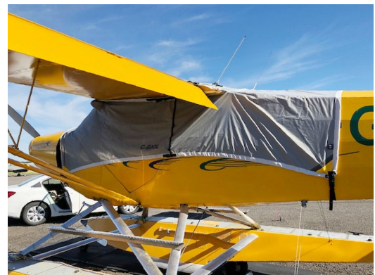
Sportsman 2+2 Wag Aero Light Weight Over the Top Travel Canopy Cover