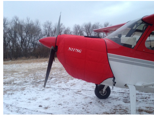
Bellanca Citabria Insulated Engine Cover