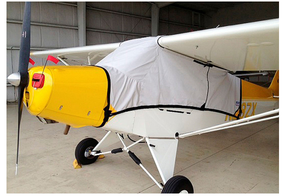
Legend Cub Over-Top Canopy Cover and Engine Plugs