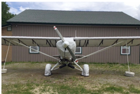
Piper PA-18-150 Super Cub Complete Cover Set

WINTER USE MATERIAL - Made with Solution-Dyed Polyester fabric, this option is intended for seasonal use to aid in deicing, rain mitigation, or for occasional travel. The material is lighter and more compact, but more susceptible to UV damage and may have a shorter useful life if used continuously outside than the all-year use material.