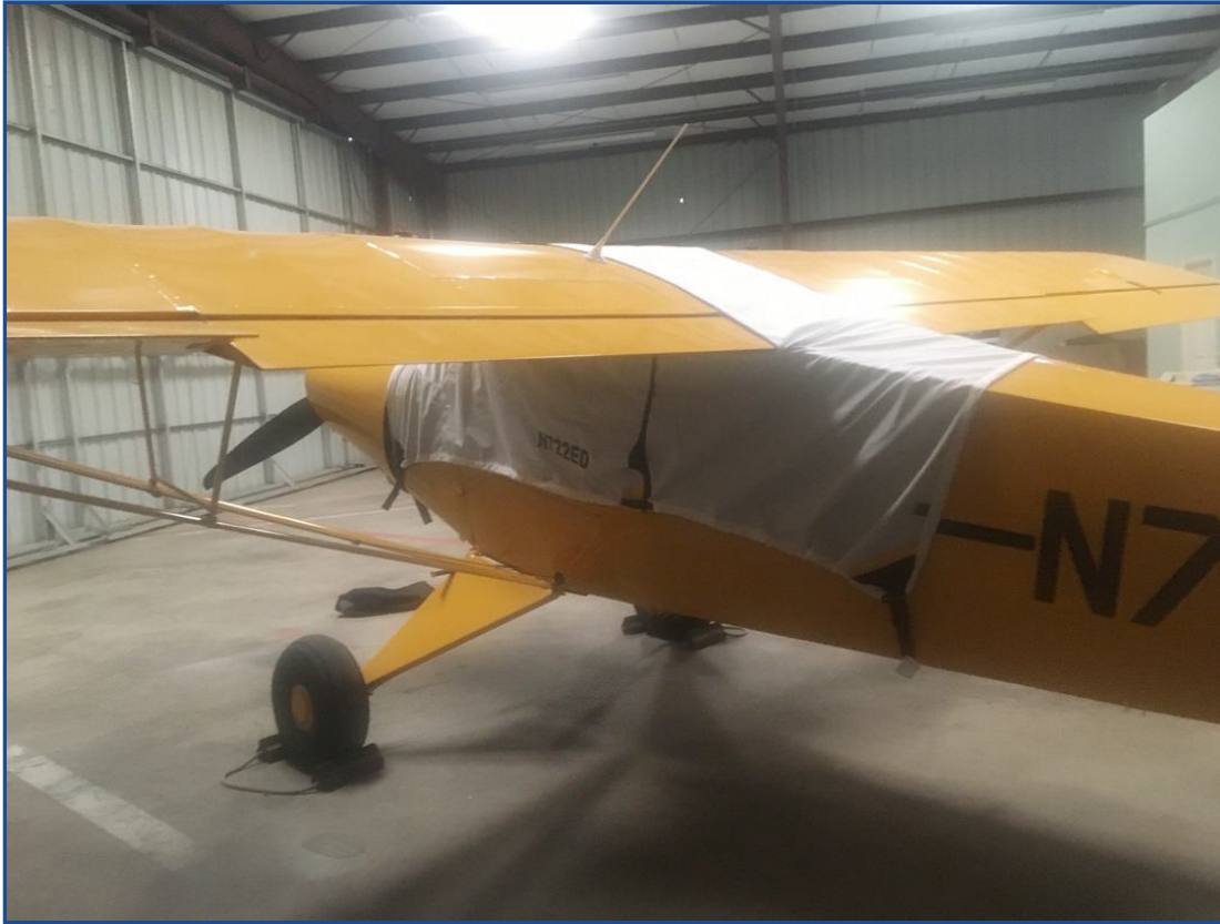
Legend AL18 Canopy Cover, Over Top Type