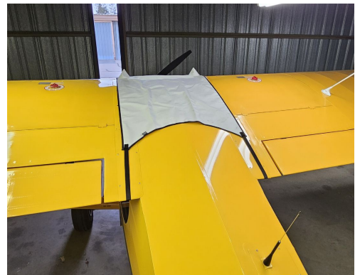
Piper J3 Canopy and Engine Covers, in Custom Sunflower Yellow. Piper PA-12: Super Cruiser, J5 Cub Windshield/Skylight Cover