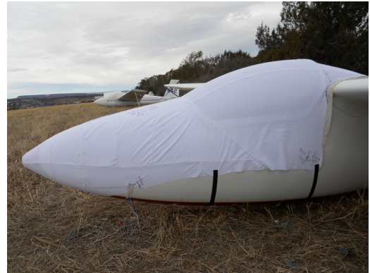
Laister LP-49 Canopy/Nose Cover, test fit cover