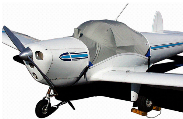
Ercoupe Canopy Cover, bubble windshield model

the Canopy Cover and Engine Cover. This cover will enclose the engine cowl and will extend aft to cover all of the windows. This cover type is made from Silver Acrylic Sunbrella canvas and is 100% lined with a soft and smooth microfiber. Bruce's Custom Covers developed this material combination especially for aircraft protection. The outer material is medium weight and treated for water resistance, UV resistance and anti-static buildup. The inner lining is a very soft and smooth microfiber to prevent scratching. The material is very reflective, and tests show that the cabin interior temperature can be reduced to near-ambient temperature on the hottest of days. It is water, ice and snow repellent, yet breathable to allow moisture to escape from between the cover and the aircraft surface.