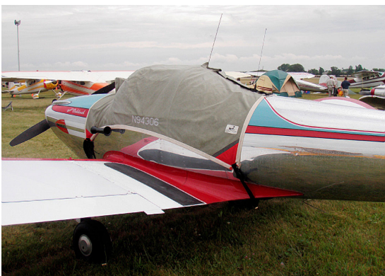
Ercoupe Canopy Cover, flat windshield model