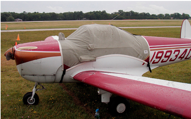
Ercoupe Canopy Cover, flat windshield model

the Canopy Cover and Engine Cover. This cover will enclose the engine cowl and will extend aft to cover all of the windows. This cover type is made from Silver Acrylic Sunbrella canvas and is 100% lined with a soft and smooth microfiber. Bruce's Custom Covers developed this material combination especially for aircraft protection. The outer material is medium weight and treated for water resistance, UV resistance and anti-static buildup. The inner lining is a very soft and smooth microfiber to prevent scratching. The material is very reflective, and tests show that the cabin interior temperature can be reduced to near-ambient temperature on the hottest of days. It is water, ice and snow repellent, yet breathable to allow moisture to escape from between the cover and the aircraft surface.