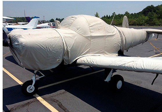
Ercoupe full cover set: Extended Canopy, Engine, Wing & Empennage covers