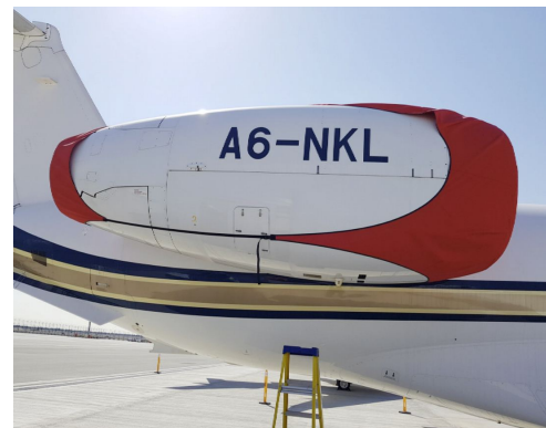
Embraer ERJ-135/140/145 Legacy 650 3-Strap Intake/Exhaust Cover