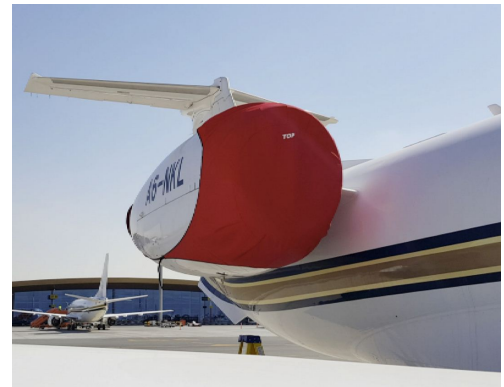
Embraer ERJ-135/140/145 Legacy 650 3-Strap Intake/Exhaust Cover