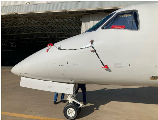
Embraer ERJ-135 Pitot/TAT/Ice Detector Covers

The Engine Inlet Plugs are custom fit for your Embraer ERJ-135/140/145 Legacy 600, 650 intakes, made with heavy-duty vinyl material, and stuffed with a single block of sculpted urethane foam. Each plug has a zipper that allows the foam to be removed and dried if necessary. Engine plugs have 'remove before flight' streamers sewn onto the face of the plugs. Most plugs are imprinted with the aircraft registration number in black for an extra charge. Storage bag NOT included. Engine plugs may be inserted after flight when the engine is still warm. Engine Inlet Plugs are commonly referred to as Cowl Plugs, Intake Plugs, Cowl Blocks, Engine Blocks, and Engine Bungs.