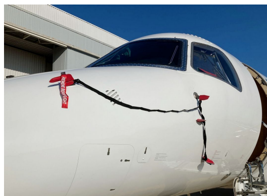
Embraer ERJ-135 Pitot/TAT/Ice Detector Covers