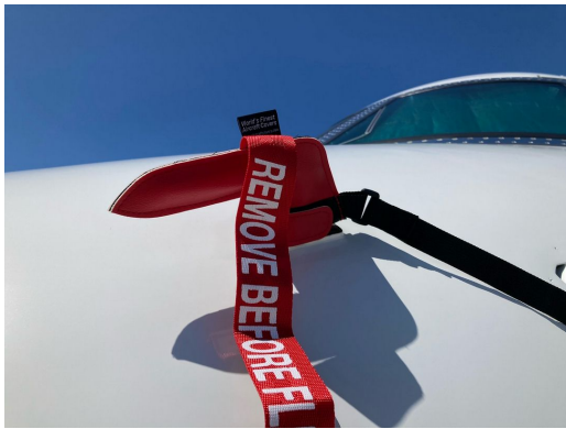
Embraer ERJ-135 Pitot/TAT/Ice Detector Covers

The Engine Inlet Plugs are custom fit for your Embraer ERJ-135/140/145 Legacy 600, 650 intakes, made with heavy-duty vinyl material, and stuffed with a single block of sculpted urethane foam. Each plug has a zipper that allows the foam to be removed and dried if necessary. Engine plugs have 'remove before flight' streamers sewn onto the face of the plugs. Most plugs are imprinted with the aircraft registration number in black for an extra charge. Storage bag NOT included. Engine plugs may be inserted after flight when the engine is still warm. Engine Inlet Plugs are commonly referred to as Cowl Plugs, Intake Plugs, Cowl Blocks, Engine Blocks, and Engine Bungs.