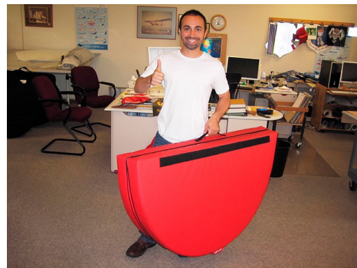
Boeing 737 FOD protection Intake Plug, folding type