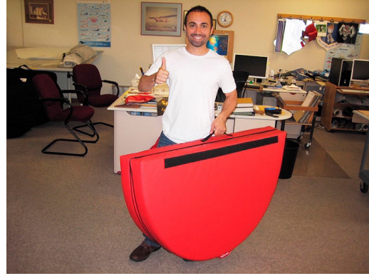
Boeing 737 FOD protection Intake Plug, folding type