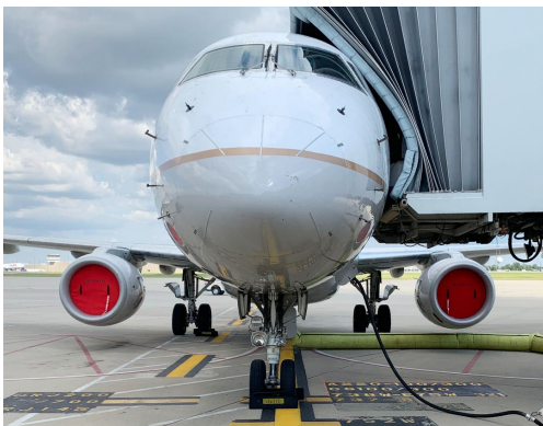
Embraer EMB-170/175 Engine Inlet Plugs

The Engine Inlet Plugs are custom fit for your Embraer EMB-170/175 intakes, made with heavy-duty vinyl material, and stuffed with a single block of sculpted urethane foam. Each plug has a zipper that allows the foam to be removed and dried if necessary. Engine plugs have 'remove before flight' streamers sewn onto the face of the plugs. Most plugs are imprinted with the aircraft registration number in black for an extra charge. Storage bag NOT included. Engine plugs may be inserted after flight when the engine is still warm. Engine Inlet Plugs are commonly referred to as Cowl Plugs, Intake Plugs, Cowl Blocks, Engine Blocks, and Engine Bungs.