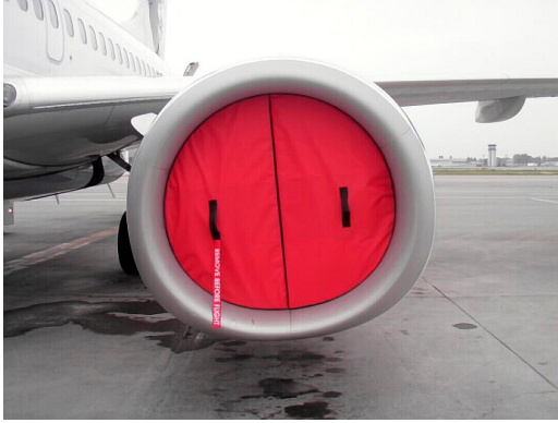
Boeing 737 Engine Intake Plug, Folding Type

ALL-YEAR USE MATERIAL - Made with Silver Acrylic Sunbrella canvas, the all-year use material is the best option for sun protection and cover longevity. This heavier more durable material is intended for all weather conditions, such as rain and snow or lots of sun.