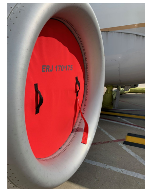
Embraer EMB-170/175 Engine Inlet Plugs