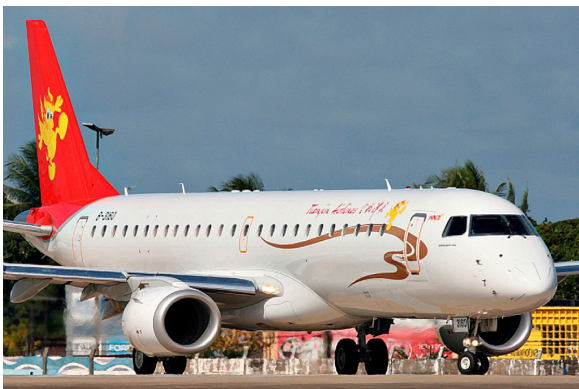
Covers, Plugs & HeatShields for Embraer 170/175/190/195

The Engine Inlet Plugs are custom fit for your Embraer EMB-170/175 intakes, made with heavy-duty vinyl material, and stuffed with a single block of sculpted urethane foam. Each plug has a zipper that allows the foam to be removed and dried if necessary. Engine plugs have 'remove before flight' streamers sewn onto the face of the plugs. Most plugs are imprinted with the aircraft registration number in black for an extra charge. Storage bag NOT included. Engine plugs may be inserted after flight when the engine is still warm. Engine Inlet Plugs are commonly referred to as Cowl Plugs, Intake Plugs, Cowl Blocks, Engine Blocks, and Engine Bungs.