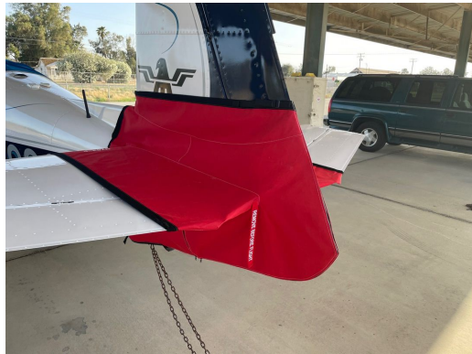
Mooney M20C Tailcone Cover

WINTER USE MATERIAL - Made with Solution-Dyed Polyester fabric, this option is intended for seasonal use to aid in deicing, rain mitigation, or for occasional travel. The material is lighter and more compact, but more susceptible to UV damage and may have a shorter useful life if used continuously outside than the all-year use material.