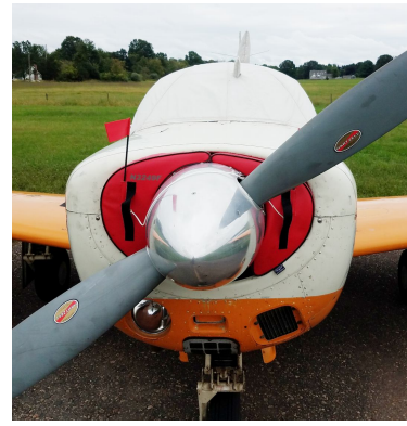
Mooney M20E Engine Inlet Plugs