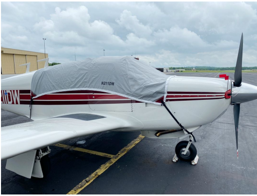
Mooney M20F Travel Weight Canopy Cover