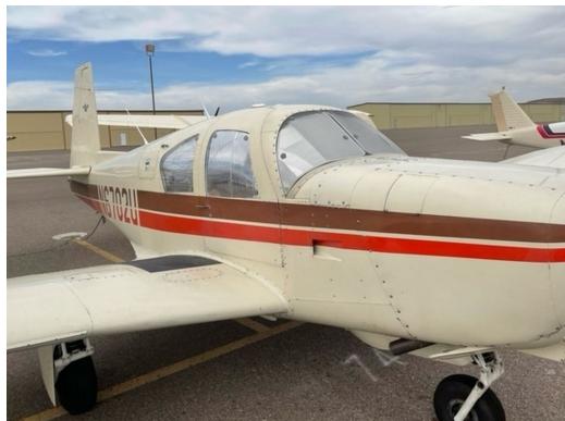
Mooney M20C Heatshield Set

Windshield Heatshields are interior sunshades for an aircraft's front windshield. The product is a unique composite of closed-cell foam with a silver mylar finish. The semi-rigid design is stiff enough to stand along the inside of the windshield using sun visors or window framing. It folds up flat and easily stores in the included storage sleeve. Some designs may require velcro and suction cups or split right and left sides. A Heatshield is an excellent short-term remedy for cockpit overheating. An external fabric cover is far more effective and practical for long-term protection.