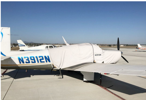
Mooney M20G Extended Canopy/Engine Cover

This cover type is made from Silver Acrylic Sunbrella canvas and is 100% lined with a soft and smooth microfiber. Bruce's Custom Covers developed this material combination especially for aircraft protection. The outer material is medium weight and treated for water resistance, UV resistance and anti-static buildup. The inner lining is a very soft and smooth microfiber to prevent scratching. The material is very reflective, and tests show that the cabin interior temperature can be reduced to near-ambient temperature on the hottest of days. It is water, ice and snow repellent, yet breathable to allow moisture to escape from between the cover and the aircraft surface.