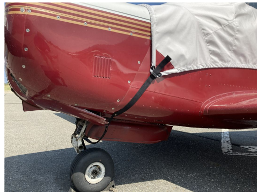
Mooney M20E Canopy Cover with Forward Extension