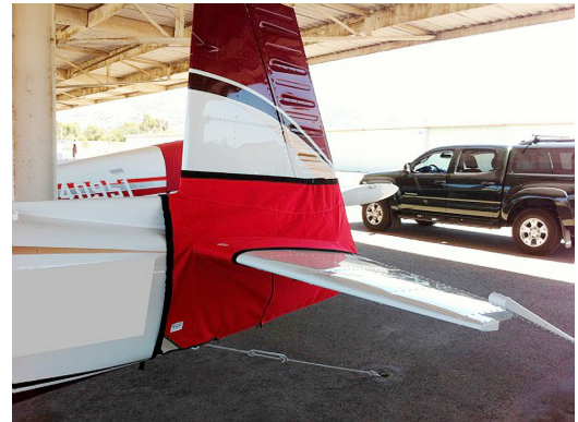
Mooney Tailcone Cover, completely enclosed