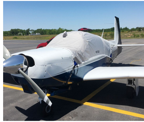
Mooney Early M20 Series Canopy Cover w/Fwd Avionics Panel Cover