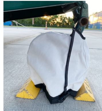
Mooney 201 Nose Wheel Cover