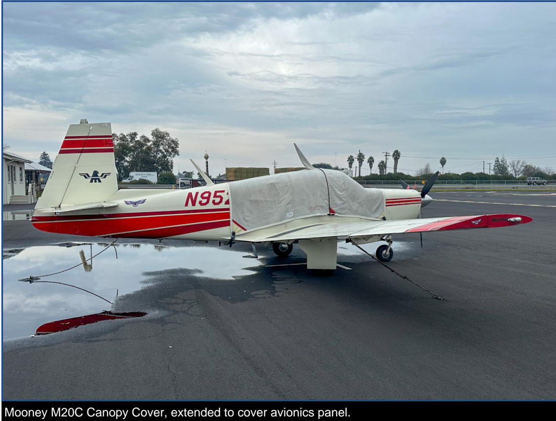
Mooney M20C Canopy Cover, extended to cover avionics panel.