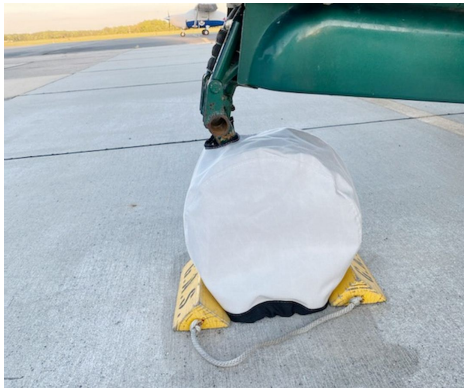
Mooney 201 Nose Wheel Cover

ALL-YEAR USE MATERIAL - Made with Silver Acrylic Sunbrella canvas, the all-year use material is the best option for sun protection and cover longevity. This heavier more durable material is intended for all weather conditions, such as rain and snow or lots of sun.