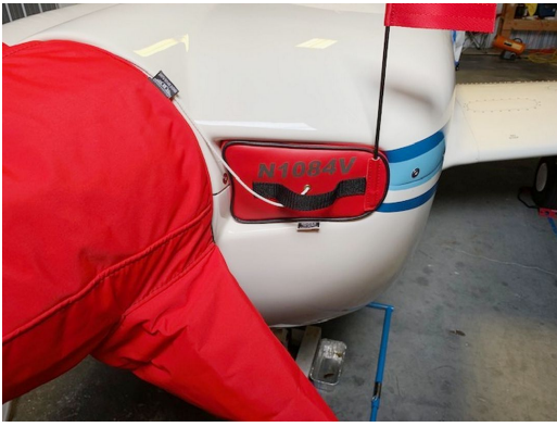
Mooney Engine Inlet Plug & Prop Cover