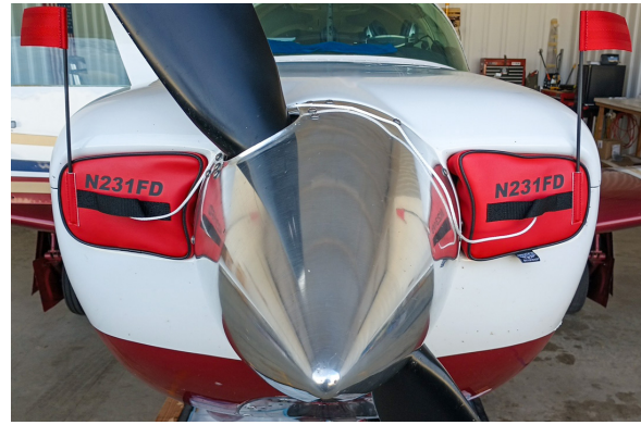
Mooney Aircraft Corp. M20K Engine Inlet Plugs (231,M20K) (set of 2)