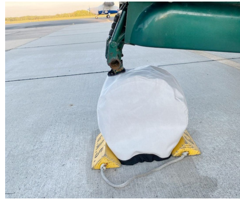
Mooney 201 Nose Wheel Cover