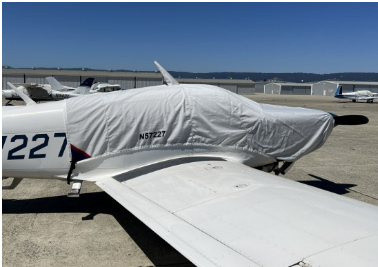
Mooney 201 (M20K) Canopy/Engine Cover

This cover type is made from Silver Acrylic Sunbrella canvas and is 100% lined with a soft and smooth microfiber. Bruce's Custom Covers developed this material combination especially for aircraft protection. The outer material is medium weight and treated for water resistance, UV resistance and anti-static buildup. The inner lining is a very soft and smooth microfiber to prevent scratching. The material is very reflective, and tests show that the cabin interior temperature can be reduced to near-ambient temperature on the hottest of days. It is water, ice and snow repellent, yet breathable to allow moisture to escape from between the cover and the aircraft surface.