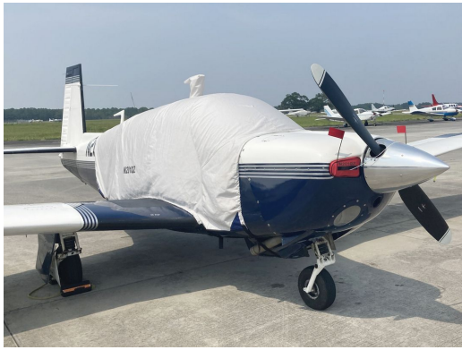
Mooney M20J Extended Canopy Cover, Engine Plugs