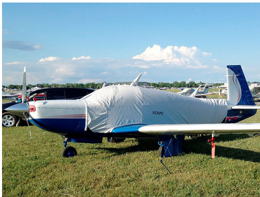
Mooney 231 Extended Canopy Cover & Engine Plugs

This cover type is made from Silver Acrylic Sunbrella canvas and is 100% lined with a soft and smooth microfiber. Bruce's Custom Covers developed this material combination especially for aircraft protection. The outer material is medium weight and treated for water resistance, UV resistance and anti-static buildup. The inner lining is a very soft and smooth microfiber to prevent scratching. The material is very reflective, and tests show that the cabin interior temperature can be reduced to near-ambient temperature on the hottest of days. It is water, ice and snow repellent, yet breathable to allow moisture to escape from between the cover and the aircraft surface.