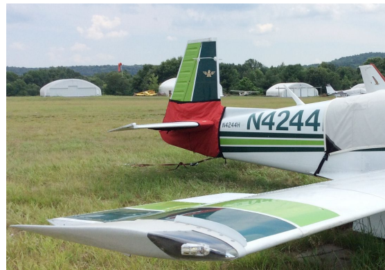
Mooney Tailcone Cover