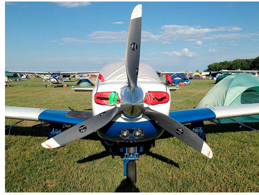
Mooney 231 Extended Canopy Cover & Engine Plugs