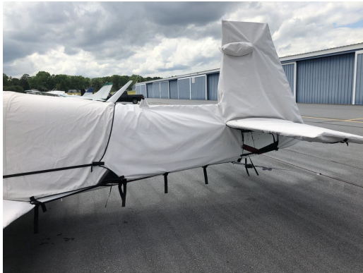
Mooney M20J Complete Cover Set

WINTER USE MATERIAL - Made with Solution-Dyed Polyester fabric, this option is intended for seasonal use to aid in deicing, rain mitigation, or for occasional travel. The material is lighter and more compact, but more susceptible to UV damage and may have a shorter useful life if used continuously outside than the all-year use material.