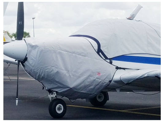
Mooney M20J Engine Cover, fully enclosed