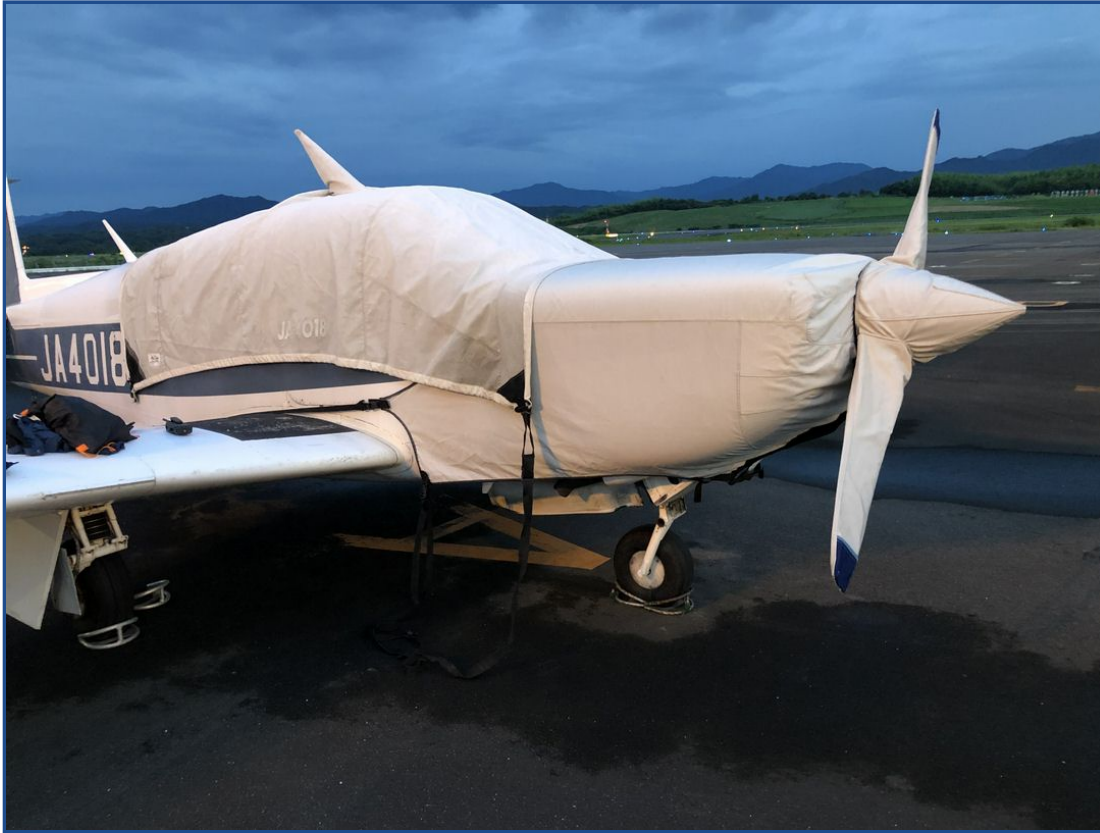
Mooney M20K Canopy, Engine &amp; Prop Covers