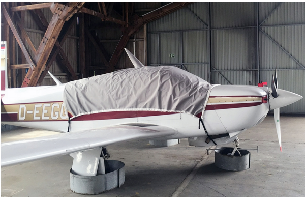
Mooney M20J/M20K Travel Cover