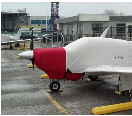
Mooney 201 Insulated Engine Cover, fully enclosed