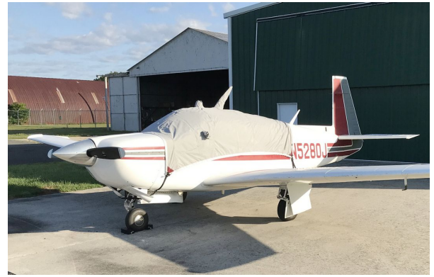
Mooney 201 M20J Travel Canopy Cover