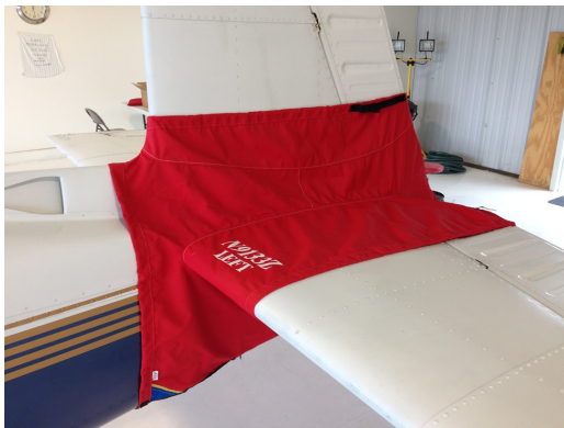
Mooney Tailcone Cover

WINTER USE MATERIAL - Made with Solution-Dyed Polyester fabric, this option is intended for seasonal use to aid in deicing, rain mitigation, or for occasional travel. The material is lighter and more compact, but more susceptible to UV damage and may have a shorter useful life if used continuously outside than the all-year use material.