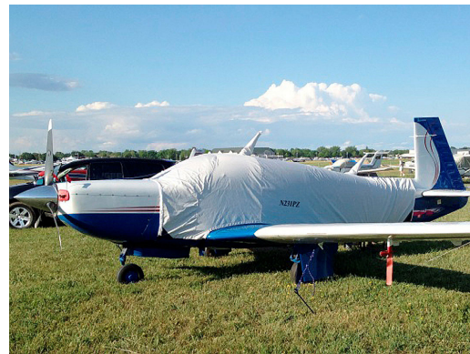
Mooney 231 Extended Canopy Cover & Engine Plugs