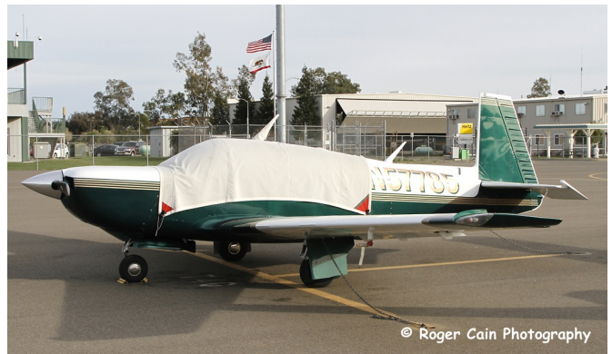
Mooney 201 Standard Canopy Cover