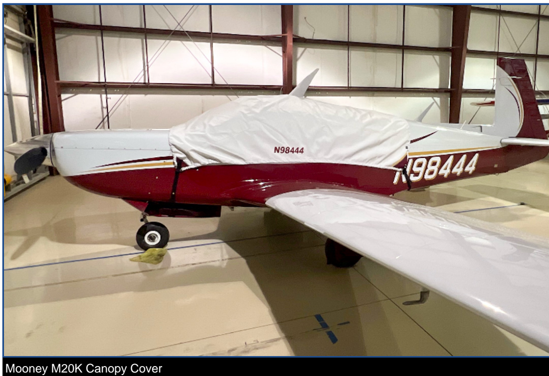
Mooney M20K Canopy Cover