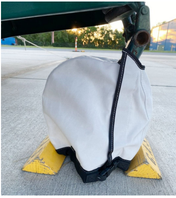
Mooney 201 Nose Wheel Cover