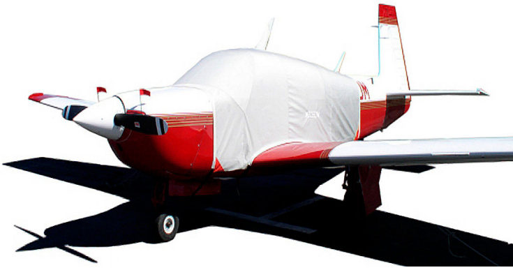
Mooney M20 Extended Canopy Cover & Engine Plugs