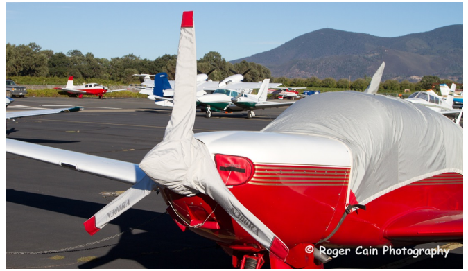
Mooney M20M Bravo 3-Blade Prop Cover, Engine Plugs