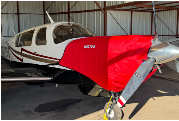
Mooney M20M, Insulated Engine Cover, doesn't cover gear well