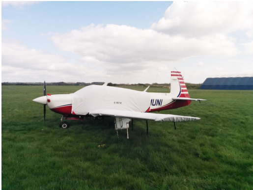
Mooney 201 Extended Canopy Cover, Wing Covers and Plugs