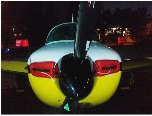
Mooney 231 Engine Inlet Plugs