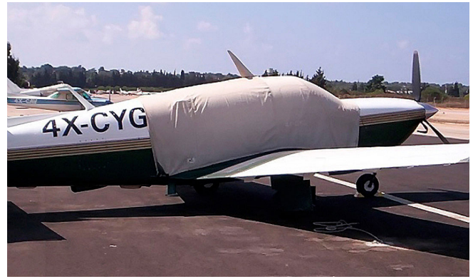
Mooney M20 Extended Canopy Cover