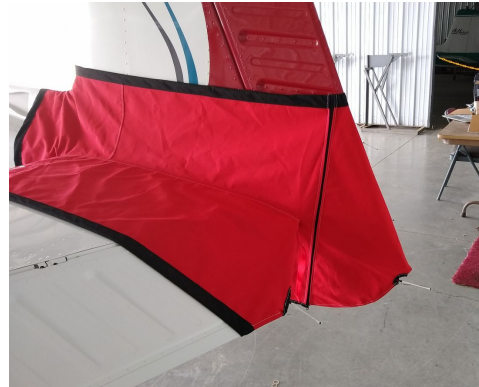
Mooney Tailcone Cover