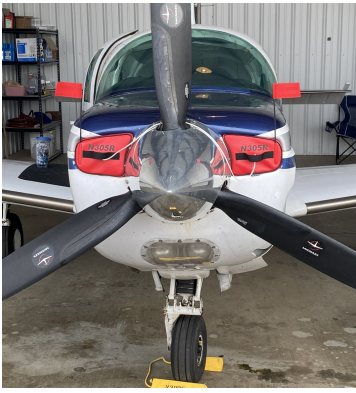
Mooney M20K Rocket Engine Inlet Plugs