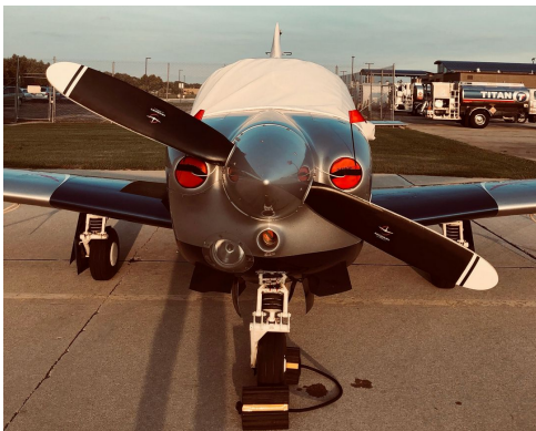
Mooney M20J Engine Plugs, Lopresti Type

This cover type is made from Silver Acrylic Sunbrella canvas and is 100% lined with a soft and smooth microfiber. Bruce's Custom Covers developed this material combination especially for aircraft protection. The outer material is medium weight and treated for water resistance, UV resistance and anti-static buildup. The inner lining is a very soft and smooth microfiber to prevent scratching. The material is very reflective, and tests show that the cabin interior temperature can be reduced to near-ambient temperature on the hottest of days. It is water, ice and snow repellent, yet breathable to allow moisture to escape from between the cover and the aircraft surface.