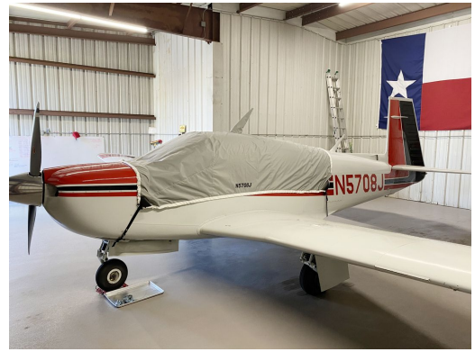
Mooney M20J Travel Cover, Light Weight Canopy Cover