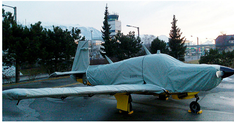
Mooney 231 Extra Extended Canopy/Engine Cover, Wing covers & Empennage Cover