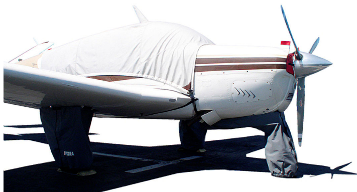
Beech Bonanza/Debonair/Baron Landing Gear Covers