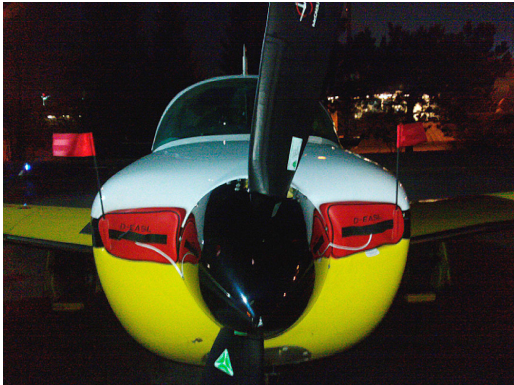
Mooney 231 Engine Inlet Plugs