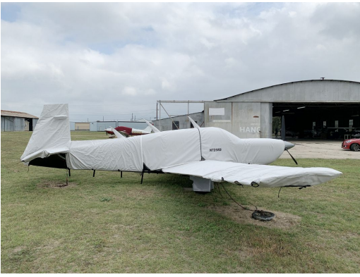
Mooney M20M Bravo Cover Set