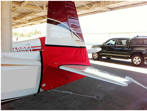
Mooney Tailcone Cover, completely enclosed