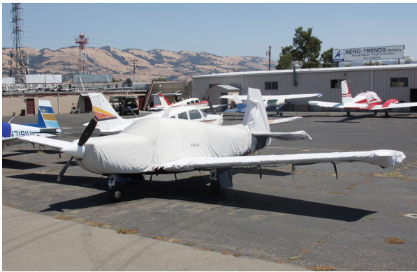
Mooney 231 Full Cover Set

This cover type is made from Silver Acrylic Sunbrella canvas and is 100% lined with a soft and smooth microfiber. Bruce's Custom Covers developed this material combination especially for aircraft protection. The outer material is medium weight and treated for water resistance, UV resistance and anti-static buildup. The inner lining is a very soft and smooth microfiber to prevent scratching. The material is very reflective, and tests show that the cabin interior temperature can be reduced to near-ambient temperature on the hottest of days. It is water, ice and snow repellent, yet breathable to allow moisture to escape from between the cover and the aircraft surface.