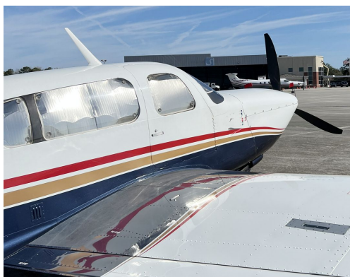
Mooney M20S Heatshield Set