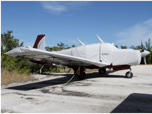
Mooney M20C Extended Canopy/Engine & Wing Covers