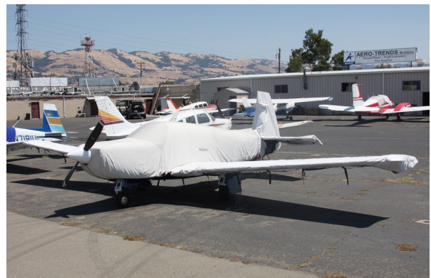
Mooney 231 Full Cover Set