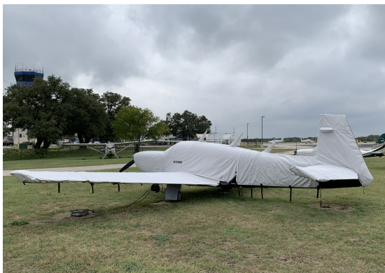
Mooney M20M Bravo Cover Set

This cover type is made from Silver Acrylic Sunbrella canvas and is 100% lined with a soft and smooth microfiber. Bruce's Custom Covers developed this material combination especially for aircraft protection. The outer material is medium weight and treated for water resistance, UV resistance and anti-static buildup. The inner lining is a very soft and smooth microfiber to prevent scratching. The material is very reflective, and tests show that the cabin interior temperature can be reduced to near-ambient temperature on the hottest of days. It is water, ice and snow repellent, yet breathable to allow moisture to escape from between the cover and the aircraft surface.