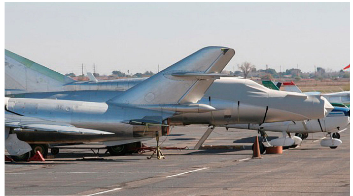
Mikoyan Mig 21 Canopy/Nose Cover