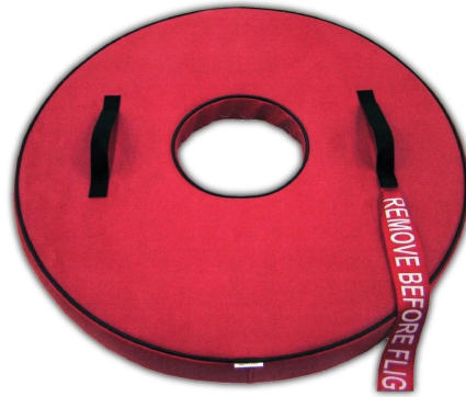
Mig 21 Intake Plug

The Engine Inlet Plugs are custom fit for your Mikoyan Mig 21 intakes, made with heavy-duty vinyl material, and stuffed with a single block of sculpted urethane foam. Each plug has a zipper that allows the foam to be removed and dried if necessary. Engine plugs have 'remove before flight' streamers sewn onto the face of the plugs. Most plugs are imprinted with the aircraft registration number in black for an extra charge. Storage bag NOT included. Engine plugs may be inserted after flight when the engine is still warm. Engine Inlet Plugs are commonly referred to as Cowl Plugs, Intake Plugs, Cowl Blocks, Engine Blocks, and Engine Bungs.