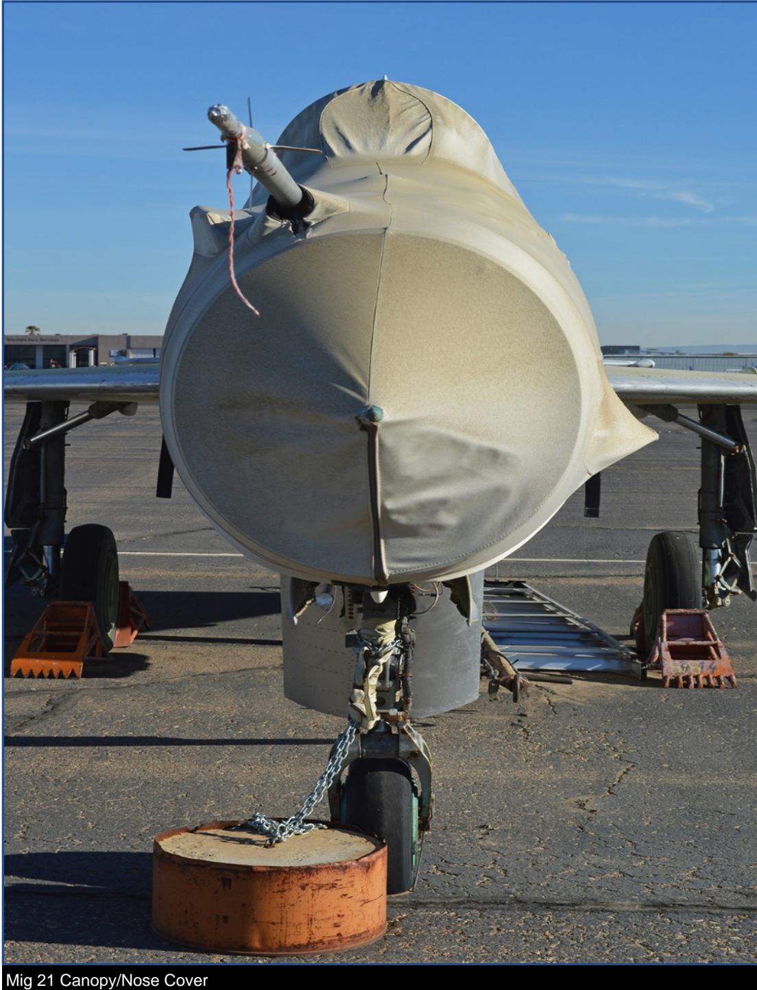
Mig 21 Canopy/Nose Cover