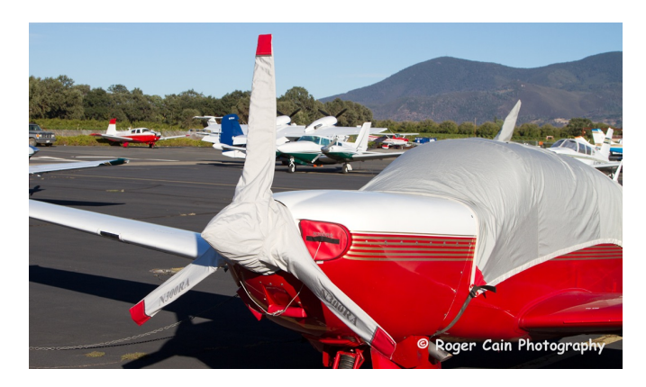
Mooney M20M Bravo 3-Blade Prop Cover, Engine Plugs