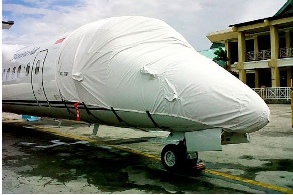
De Havilland Dash 8 Cockpit/Nose Cover

This cover type is made from Silver Acrylic Sunbrella canvas and is 100% lined with a soft and smooth microfiber. Bruce's Custom Covers developed this material combination especially for aircraft protection. The outer material is medium weight and treated for water resistance, UV resistance and anti-static buildup. The inner lining is a very soft and smooth microfiber to prevent scratching. The material is very reflective, and tests show that the cabin interior temperature can be reduced to near-ambient temperature on the hottest of days. It is water, ice and snow repellent, yet breathable to allow moisture to escape from between the cover and the aircraft surface.