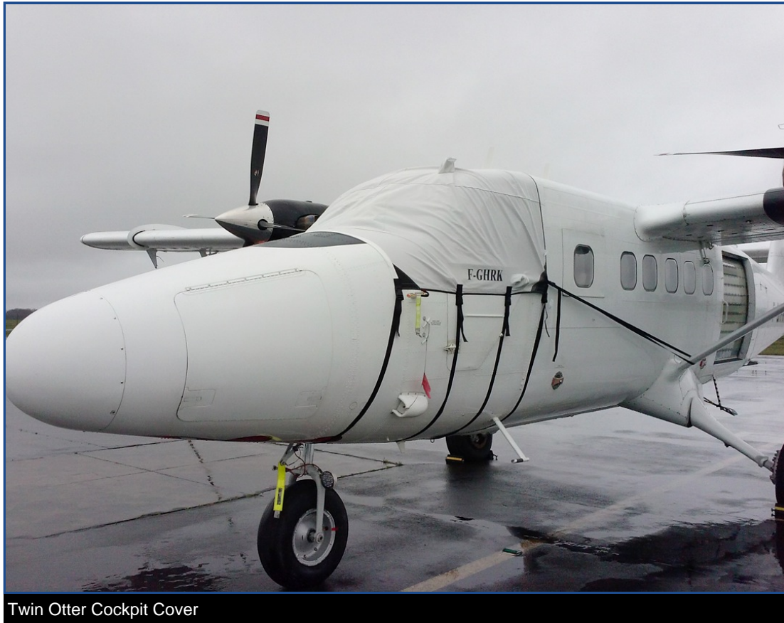
Twin Otter Cockpit Cover