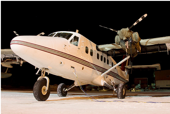
Twin Otter Wing, Horiz. Stab & Engine Covers