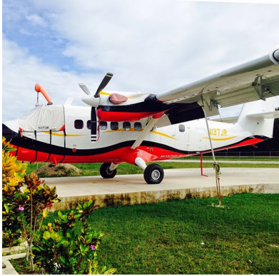
Twin Otter Cockpit Cover & Engine Plugs

This cover type is made from Silver Acrylic Sunbrella canvas and is 100% lined with a soft and smooth microfiber. Bruce's Custom Covers developed this material combination especially for aircraft protection. The outer material is medium weight and treated for water resistance, UV resistance and anti-static buildup. The inner lining is a very soft and smooth microfiber to prevent scratching. The material is very reflective, and tests show that the cabin interior temperature can be reduced to near-ambient temperature on the hottest of days. It is water, ice and snow repellent, yet breathable to allow moisture to escape from between the cover and the aircraft surface.