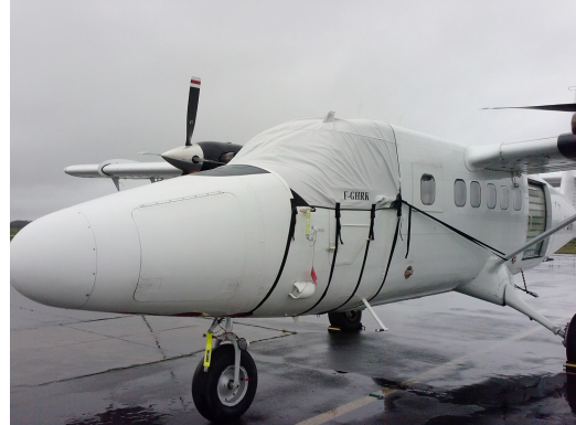
Twin Otter Cockpit Cover