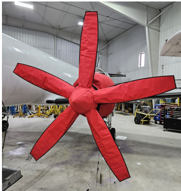
Fairchild Metro 5 Blade Insulated Insulated Prop Covers

Covers developed this material combination especially for aircraft protection. The outer material is medium weight and treated for water resistance, UV resistance and anti-static buildup. The inner lining is a very soft and smooth microfiber to prevent scratching. The material is very reflective, and tests show that the cabin interior temperature can be reduced to near-ambient temperature on the hottest of days. It is water, ice and snow repellent, yet breathable to allow moisture to escape from between the cover and the aircraft surface.