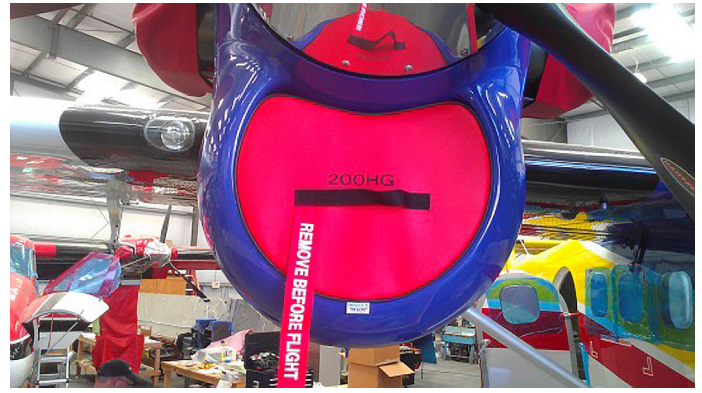
De Havilland Twin Otter Engine Inlet Plug and Exhaust Covers