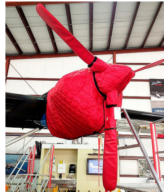
De Havilland Twin Otter Insulated Engine & Insulated Propellor/Spinner Covers