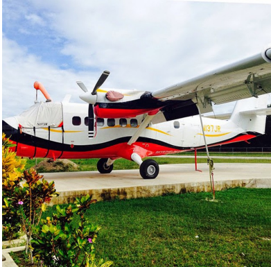
Twin Otter Cockpit Cover & Engine Plugs

This cover type is made from Silver Acrylic Sunbrella canvas and is 100% lined with a soft and smooth microfiber. Bruce's Custom Covers developed this material combination especially for aircraft protection. The outer material is medium weight and treated for water resistance, UV resistance and anti-static buildup. The inner lining is a very soft and smooth microfiber to prevent scratching. The material is very reflective, and tests show that the cabin interior temperature can be reduced to near-ambient temperature on the hottest of days. It is water, ice and snow repellent, yet breathable to allow moisture to escape from between the cover and the aircraft surface.