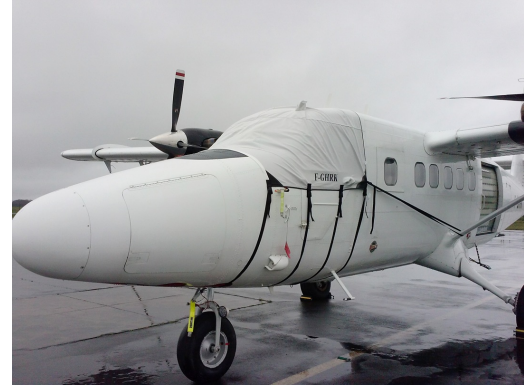
Twin Otter Cockpit Cover