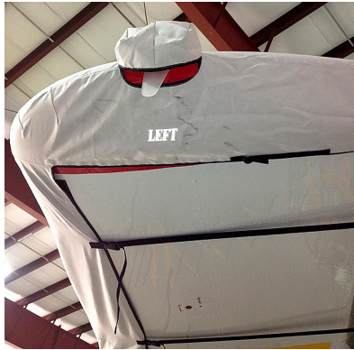
De Havilland Twin Otter Wing Cover wing tip detail

WINTER USE MATERIAL - Made with Solution-Dyed Polyester fabric, this option is intended for seasonal use to aid in deicing, rain mitigation, or for occasional travel. The material is lighter and more compact, but more susceptible to UV damage and may have a shorter useful life if used continuously outside than the all-year use material.