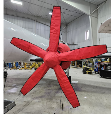
Fairchild Metro 5 Blade Insulated Insulated Prop Covers