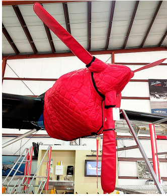
De Havilland Twin Otter Insulated Engine & Insulated Propellor/Spinner Covers

Covers developed this material combination especially for aircraft protection. The outer material is medium weight and treated for water resistance, UV resistance and anti-static buildup. The inner lining is a very soft and smooth microfiber to prevent scratching. The material is very reflective, and tests show that the cabin interior temperature can be reduced to near-ambient temperature on the hottest of days. It is water, ice and snow repellent, yet breathable to allow moisture to escape from between the cover and the aircraft surface.